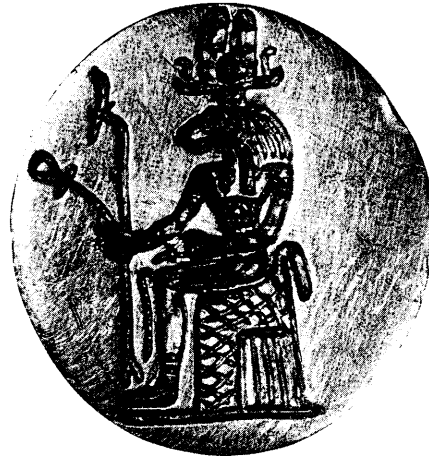
RING WITH THE GOD AMUN ENTHRONED

As I have tried to suggest, the Egyptians, for all their conservative Egyptocentricity, were immune neither to change nor to foreign influence. What cannot be denied, however, is that their ability to resist change was often prodigious. Though they had suffered foreign rulers, it was the conquerors who became converts to Egyptian culture, rather than the other way around. The Kushite kings (715–664) are a good example. Invading Egypt from the south, they were Egyptianized very