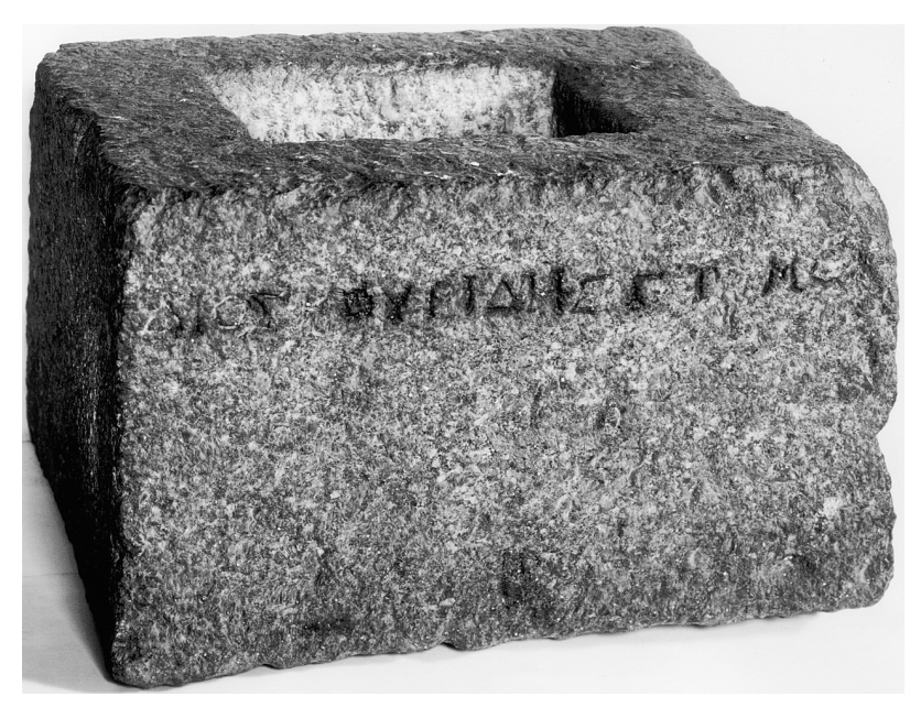
FIGURE 2. Photograph of granite block

They do not appear to rest on any good ancient authority, they were repeated from author to author, and when their consequences are examined, they lead to impossibilities and absurdities. The actual numbers were probably lower, perhaps by as much as one order of