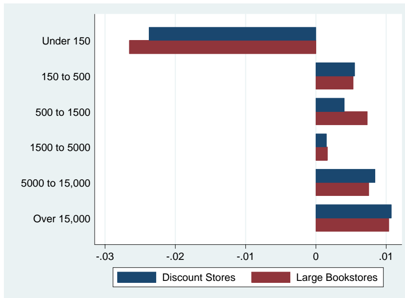
Figure 2: Discount Store/Specialty Store Comparison Marginal Effect of Store Entry by Sales Rank, (Based on Table 3 column (1))