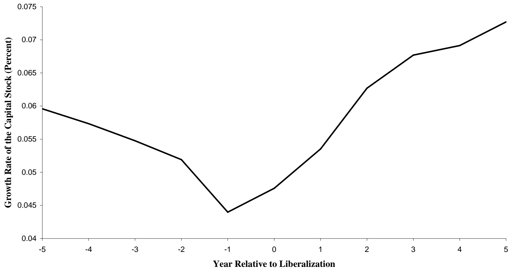
Figure 2. Investment Booms When Countries Liberalize the Capital Account .