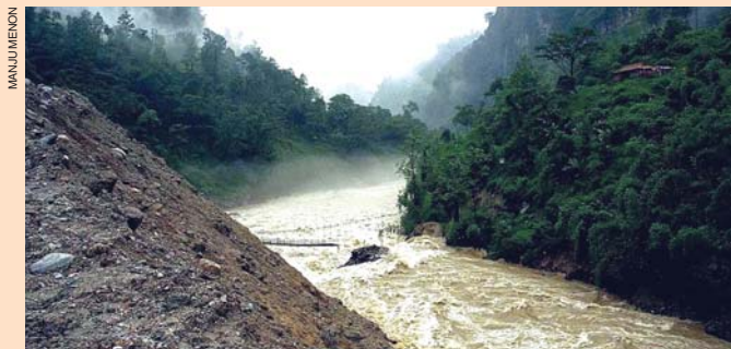
Illegal dumping of muck and debris in the Teesta river during the construction of the now commissioned 510 MW Teesta V project in Sikkim.

1 Kalpavriksh case study on ‘Compliance and monitoring of environmental clearance conditions of the Kameng hydroelectric project’, Arunachal Pradesh (2008). This has also been reported in the CAG report of 2009 on implementation of 10 th Five Year Plan power projects in the Northeast and East by NEEPCO and NHPC.