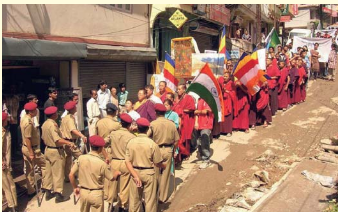
Police stop a peace march by Buddhist monks and other groups against large hydel projects in Sikkim in 2007. The march was held on Gandhi Jayanti, October 2nd.