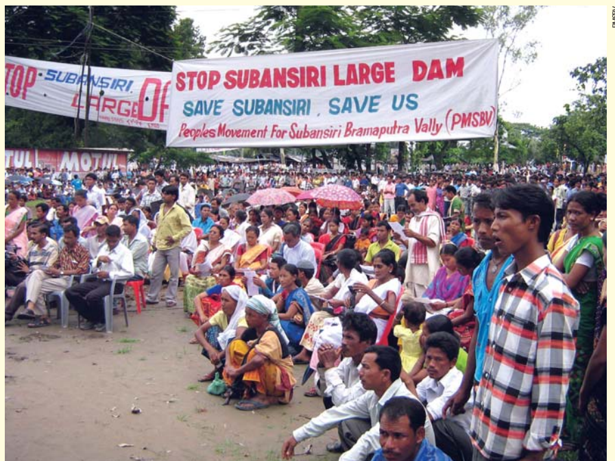
Local movements make their presence felt at a rally downstream of the under-construction 2,000 MW Lower Subansiri hydroelectric project organised by the Mising Students Union and the Krishak Mukti Sangram Samiti.