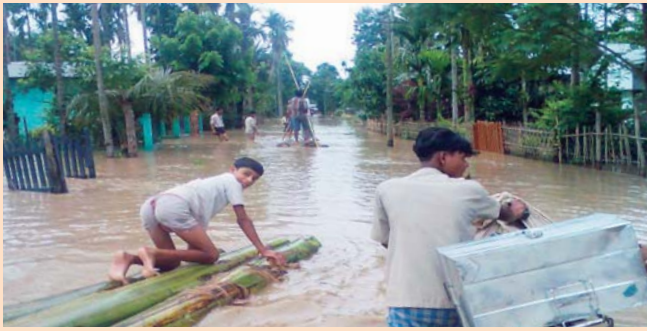
The June 14, 2008 floods in the Lakhimpur district of Assam were aggravated by sudden releases from the 405 MW Ranganadi hydroelectric project.

Arunachal Pradesh, only one project on the Dibang river is officially a 'multipurpose' project. Major hydropower projects in the lower reaches of several rivers such as the Siang, Lohit and Subansiri are not multipurpose projects and have negligible flood moderation components, even as per the admission of project authorities. More importantly, many of the dam-induced floods occurrences across the country, highlighted earlier, have been from dams with explicit flood moderation components such as Ukai, Damodar, Bhakra and Hirakud.