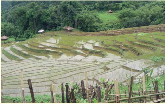
The 2,700 MW Lower Siang project in Arunachal Pradesh will submerge most of the arable lands in the affected area.

Despite major movements emerging in the region raising serious concerns about the impacts of dams, it will be misleading to argue that there is universal opposition to hydropower projects across the Northeast. In states such as Sikkim, Arunachal Pradesh and Manipur, there are also those amongst local communities who are defending the projects. Monetary gains from sale of land, small contracts during construction and a promise of quicker development of basic infrastructure like roads and bridges is cited as a major motivation. Responding to these arguments, journalist-activist Raju Mimi, from Dibang Valley, Arunachal Pradesh says: “We certainly want a bridge across the Lohit river at Dholla ghat. But the government cannot thrust on us some of the world’s largest hydropower projects, such as 3,000 MW Dibang and 4,000 MW Etalin, by promising that we will get a bridge in return! What kind of governance is this? We should get the bridge irrespective of whether these hydropower projects come up or not.”