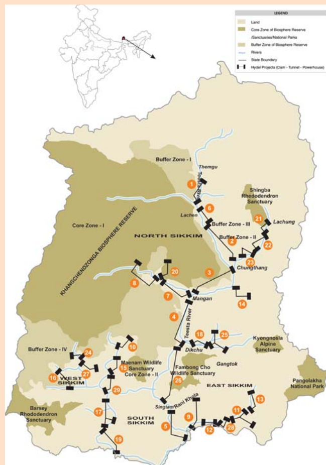
Plans for multiple large run-of-the-river hydropower projects in Sikkim will leave virtually no stretch of the Teesta river flowing free

MAP NOT TO SCALE/ SANCTUARY ASIA, ADAPTED FROM MAP OF DEPARTMENT OF HYDROPOWER, SIKKIM.