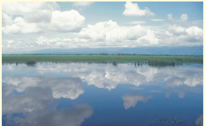
The ecology of wetlands (beels) in the Brahmaputra valley is intricately connected with the rivers. Dam-induced changes will also impact the downstream wetlands and those whose livelihoods are dependent on these.

The flow during peak load water releases in the Subansiri river in winter will be equivalent to average monsoon flows and will cause a