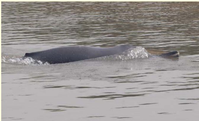
Northeastern wildlife biologists have raised concern about the impact of multiple hydropower projects in the Brahmaputra basin on the national aquatic animal, the gangetic river dolphin.