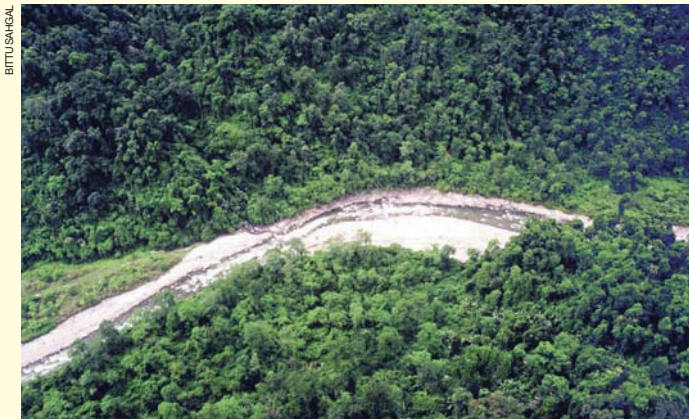
Biodiversity-rich ecosystems on the Assam-Arunachal Pradesh border will be negatively impacted by the under-construction 2000 MW Lower Subansiri hydroelectric project.

The Brahmaputra 4 is one of the world's largest rivers, with a drainage basin of 580,000 sq km, 33% of which is in India. Originating