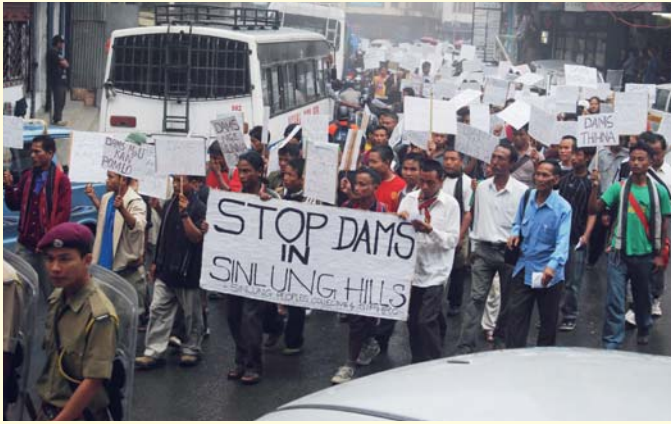
SINLUNG INDIAN PEOPLE'S HUMAN RIGHTS ORGANISATION