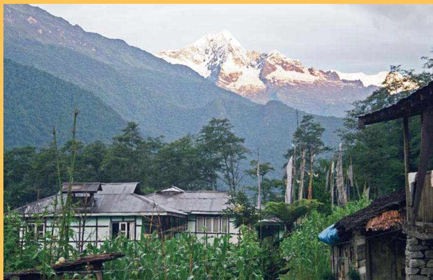
The Khangchendzonga landscape in the Eastern Himalayas in Sikkim is likely to face the brunt of climate change. Major hydropower development is planned in the region.

Perhaps there is no middle path to walk here. It will not be possible to create a win-win situation in a business-as-usual scenario involving construction of more and more large hydropower projects in the Northeast. Large