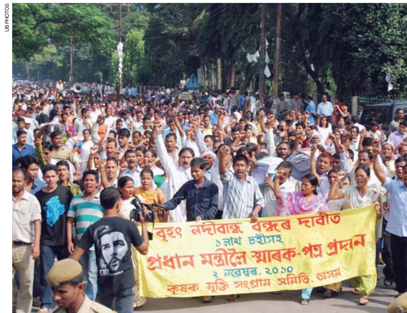
A protest rally against large dams in the Brahmaputra river basin held in Guwahati in November 2010.