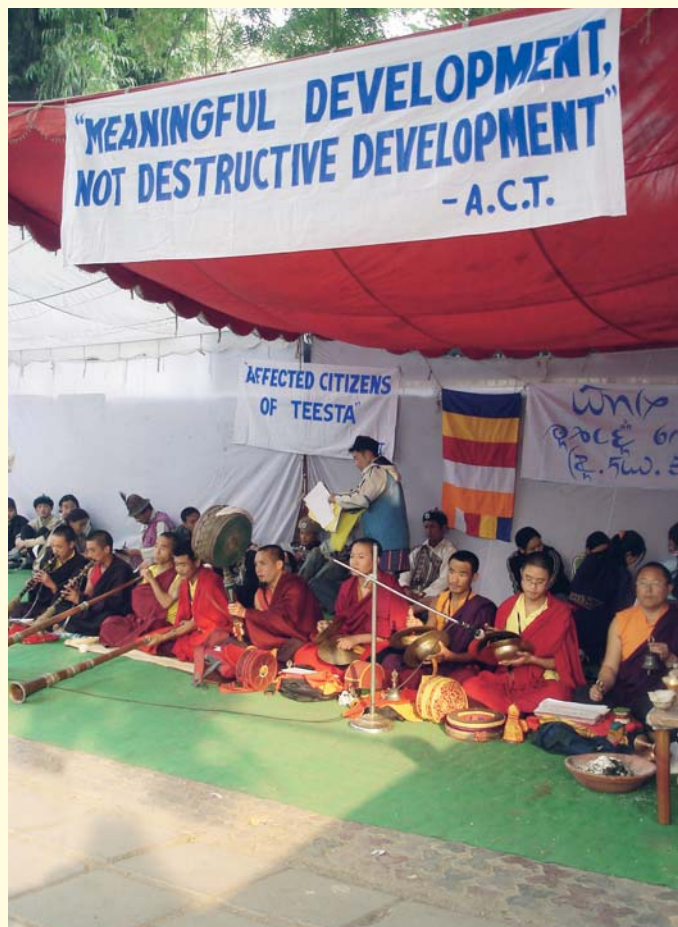
The Affected Citizens of Teesta stage a protest in New Delhi in December 2007 during their marathon satyagraha against the dams juggernaut in Sikkim.

look forward to financial compensation. As big business houses get ready to invest thousands of crores in these hydropower projects, sharp internal conflicts are increasing. Historian, Dr. Arupjyoti Saikia, says: "The State Governments' and a few others are indeed supporting these proposed investments. But the region's historical experience of exploitation of natural resources like land and oil, has led to apprehensions amongst a large section of people about the possible detrimental role of this capital - in the form of 'hydro dollars' as it has often been described by its votaries - towards the larger well being of the region. Civil society has pointed out that the colonial capital inflow into the region in the form of tea-plantations could hardly generate enough economic space where the local people could have participated, besides locking off huge land resources out of their reach. The same