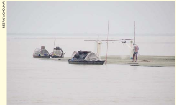
The altered flow patterns in the Brahmaputra and its tributaries due to multiple large dams will have a substantial impact on fisheries and livelihoods in the Brahmaputra valley.