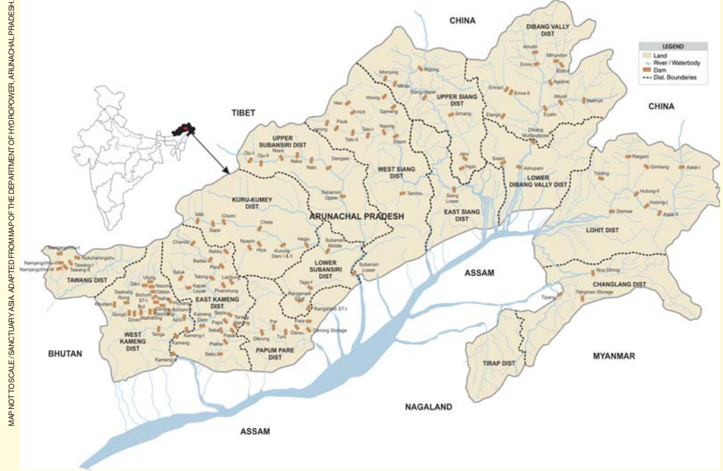
The cumulative social and environmental impacts of over 130 hydropower projects proposed in Arunachal Pradesh has been a matter of intense debate in the state and in downstream Assam.

In fact, the National Environmental Appellate Authority (NEAA) 12 , a special environmental court, in an April 2007 order has also observed that it feels the need for “advance cumulative study of series of different dams coming on any river so as to assess the optimum capacity of the water resource giving due consideration to the requirement of the Human beings, Cattle, Ecology/ Environment etc.” However, this order has been repeatedly violated by the MoEF. Even though river basin-level studies have been prescribed for some river basins such as the Bichom and Lohit in Arunachal Pradesh, these have been de-linked from clearances to be granted to individual projects. Therefore, project clearance can continue business as usual, without completion of cumulative studies, making it a cosmetic exercise.