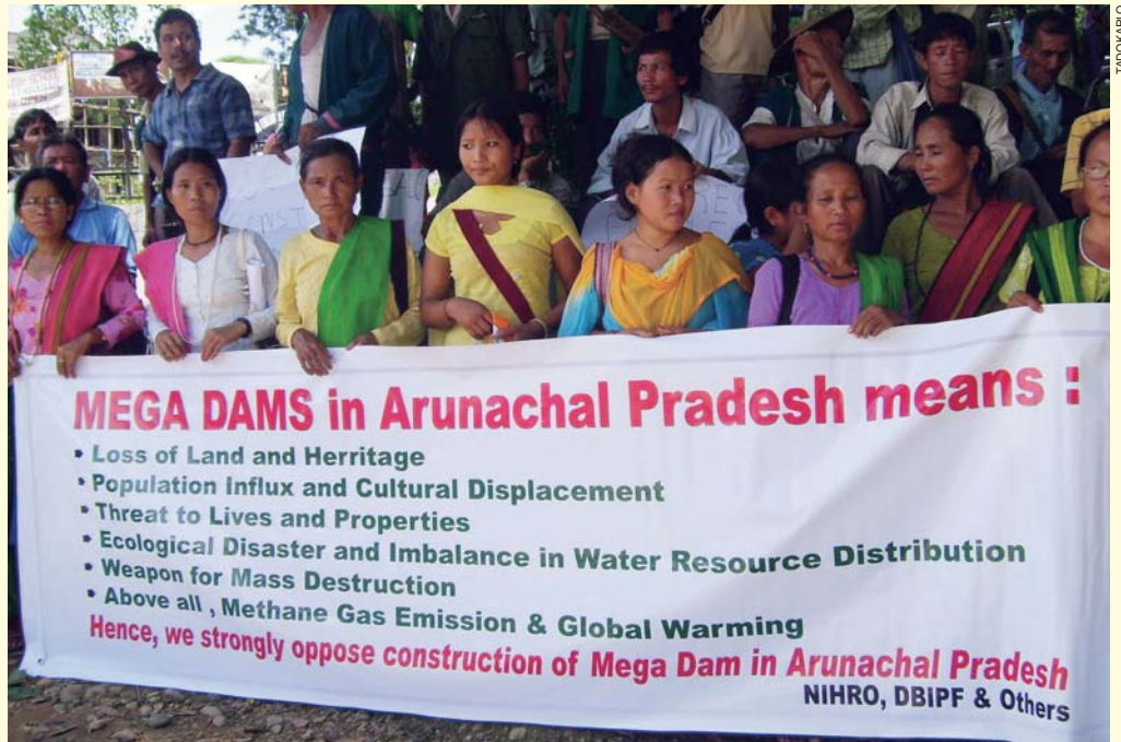
Women activists at a protest rally against large dams held in Itanagar, the capital of Arunachal Pradesh, in July 2007.