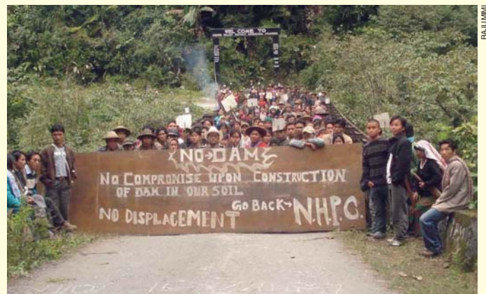
The Idu Mishmi community, opposed to the 3,000 MW Dibang Multipurpose project, block the conduct of what they believe was a farcical public hearing in March 2008.