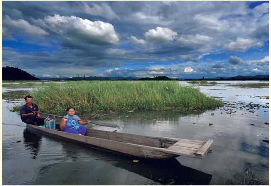
The fragile ecology of the Loktak lake and livelihoods of those dependent on it have been seriously impacted by the Loktak hydroelectric project in Manipur. Lessons must be learnt from such cases before embarking on massive dam expansion plans in the Northeast.