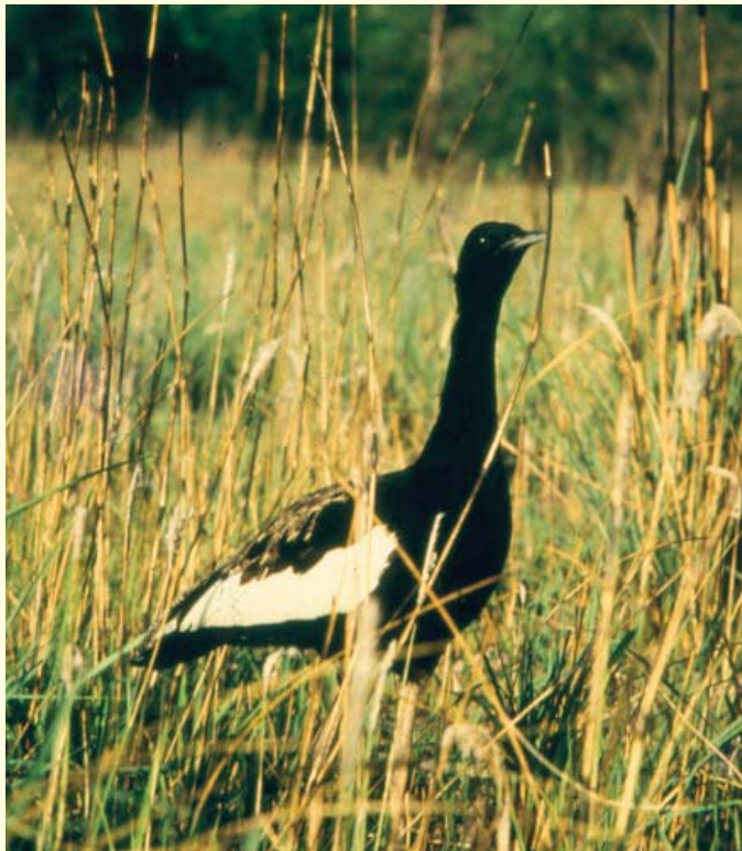
The EIA report of the 1750 MW Demwe Lower project was completely silent on the downstream impacts of the project on critically endangered grassland birds such as the Bengal Florican in the Lohit river basin.