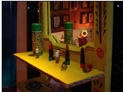
The tools of the sex trade.

A: No one tells the truth about himself, so I don't know. So many different kinds of men. Many drink alcohol before coming here. Some want to have kinky sex. They behave horribly if you refuse, they hit you and bite you. Those who drink too much before coming here, misbehave. Sometimes they come here drunk and create a ruckus.