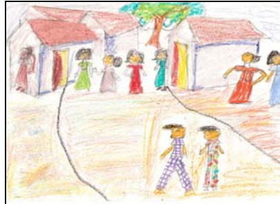
A child's view of life in prostitution.