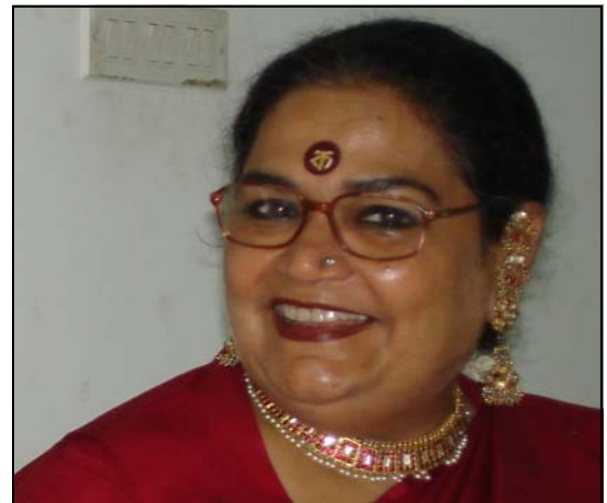
Usha Uthup, singer and poet

On the whole, however, Chingaari will just remain a spark [ chingaari ], not more.