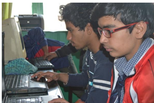
Children learning computer skills at the Care Home