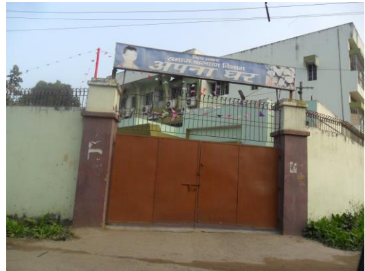
Apnaghar – Government Boys Shelter Home, Patna

In January 2014 Naz India with the support of Adoptionscentrum embarked on the Peer-Educators training program in Bihar. We covered 14 districts of Bihar across Northern and Southern parts of the State. We visited several child care institutions, care homes, orphanages, observation homes, community based organizations and residential schools for children from underprivileged backgrounds.