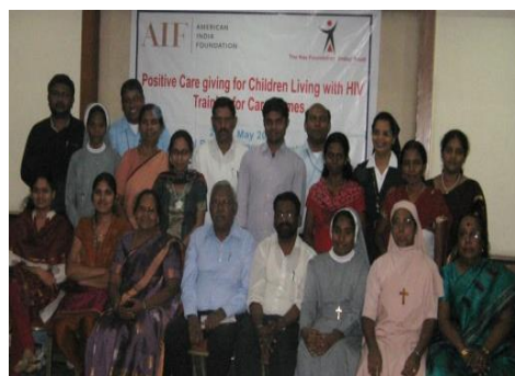
Participants of various Care Homes in Andhra Pradesh

CAPACITY BUILDING: One of the major findings of the all the care homes are no staffs are trained in professional way. But all of them work with the knowledge and skills they have gained while working in the institution. Some of the institutions have appointed people from the positive community as care givers. Since there is no formal training many of the staff especially the caregivers have limited and outdated knowledge. The care home staffs are not