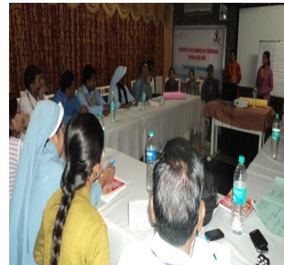
Training session in process at Maharashtra

We also conducted training for the Care homes of Maharashtra at Hotel Rahul from 11-14 December 2013. This was the second training as the first one was held at Pune in September 2012. There were 35 Participants from 19 organizations of 7 districts of Maharashtra. Besides the Naz Training team we had experts from Maharashtra to take the sessions. This training was rated as excellent by the participants as their expectations were met. The participants had an exposure visit to one care home and another care home which has vocational training facility for the HIV positive children. We also had the CWC chairpersons from three districts Nagpur, Akola and Aurangabad participating in this training.