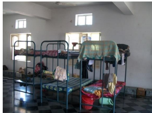
Inside one of the Care homes

affected by HIV. This assessment would enable us in selecting the partner organizations that could be provided capacity building for quality care and support to children infected and affected by HIV and those vulnerable to it. The visits were made from 4 th March to 9 th March.