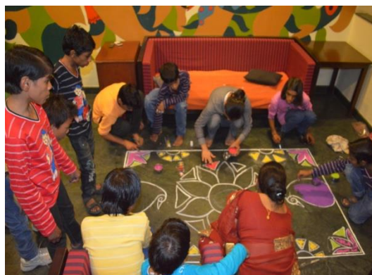
Diwali celebrations at the NAZ Care Home