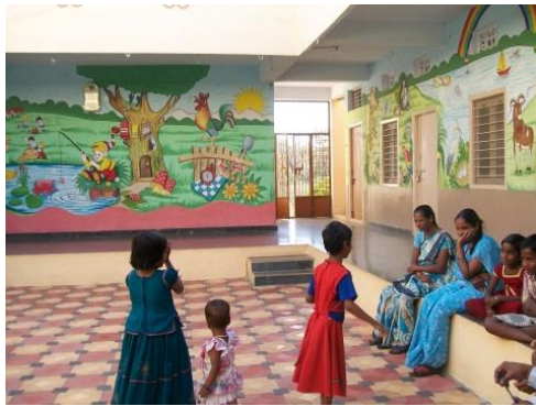
A Care Home

As part of the Institutional Capacity Building to Enhance Care and Support for Children