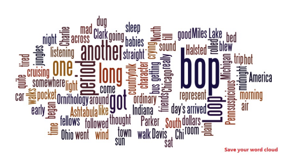
Figure 4: An example word cloud.

• Finally, the user can also export all extracted information to a CSV file which contains every place extracted, their corresponding geo-coordinates, the country and an empty column where the user can provide annotations for places (see Import Component next). An example exported file is shown in Figure 5. This exported CSV file can be edited and reloaded by other users and can be re-used on other mapping platforms as well.