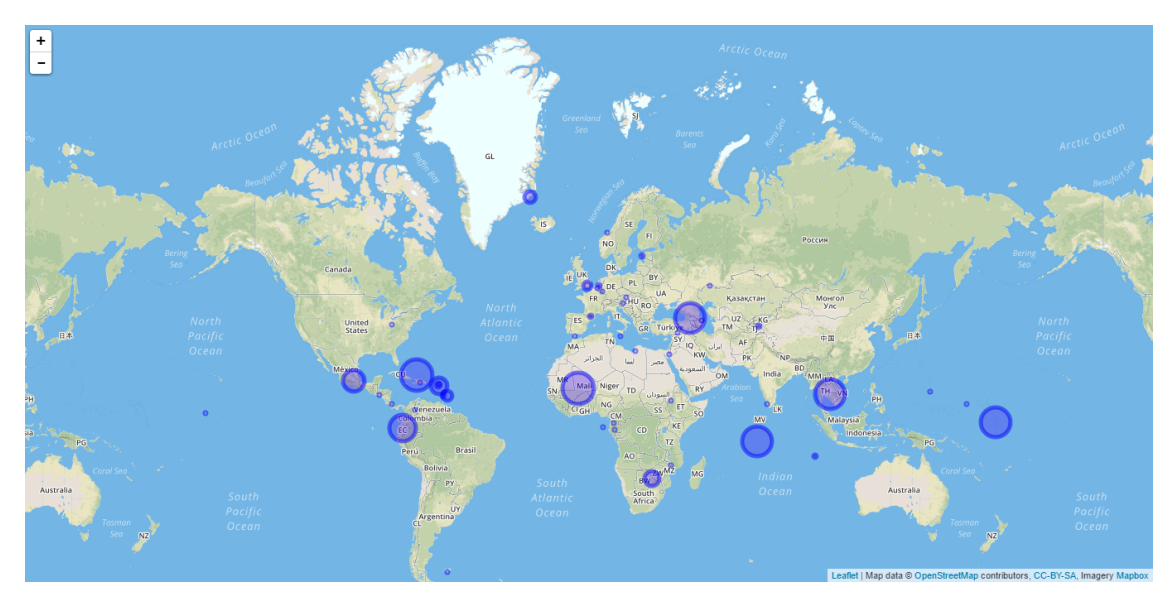
Figure 3: An example map generated by TopoText.

• The user can generate a map of all extracted places using Leaflet, which is an open-source JavaScript library for interactive maps (lea, 2016). To be able to do this, the extracted places by the NER tool are first geoparsed through the GeoNames web service (geo, 2016). GeoNames is the largest open gazetteer that is historical, multilingual, and provides alternative spellings for place names. This differentiates TopoText from many other mapping tools that rely on modern gazetteers such as Google Maps, thus excluding historical place names, alternative spellings (a common historical occurrence before the standardization of spelling and in works translated from other languages), and works written in other languages. In contrast, by relying on GeoNames, TopoText is able to extract these variations and provides the end-user with a list of all the alternative locations that a place may be referring to. The user can then specify which location a place refers to before it is rendered on the map. Additionally, the user can also view the weight of each place on the map, where the weight of a place is the frequency by which it appeared in the text. That is, the most frequent places mentioned in the text will have bigger markers on the map. An example map is shown in Figure 3.