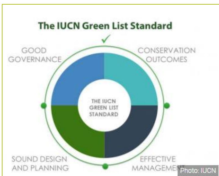
Figure 1: Four components of the Green List Standard

There are four main components to the Green List Standard – (1) good governance, (2) sound planning and design, (3) effective management, and (4) conservation outcomes (see Figure 1).