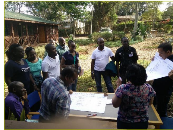
Participants planning and reflecting on governance assessment processes