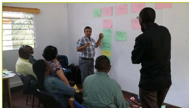
Group exercise on understanding the good governance principles