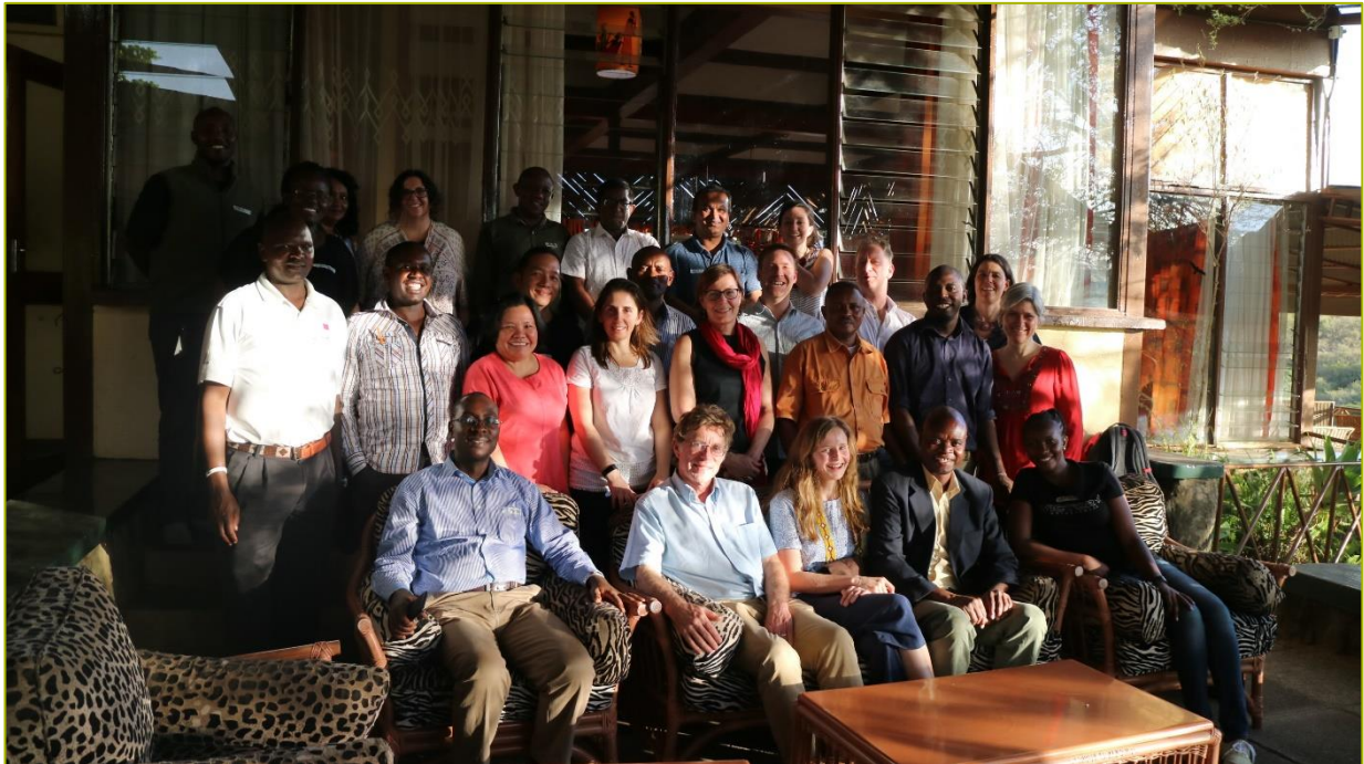
'Governance, Equity and the Green List' workshop participants on days 1 and 2