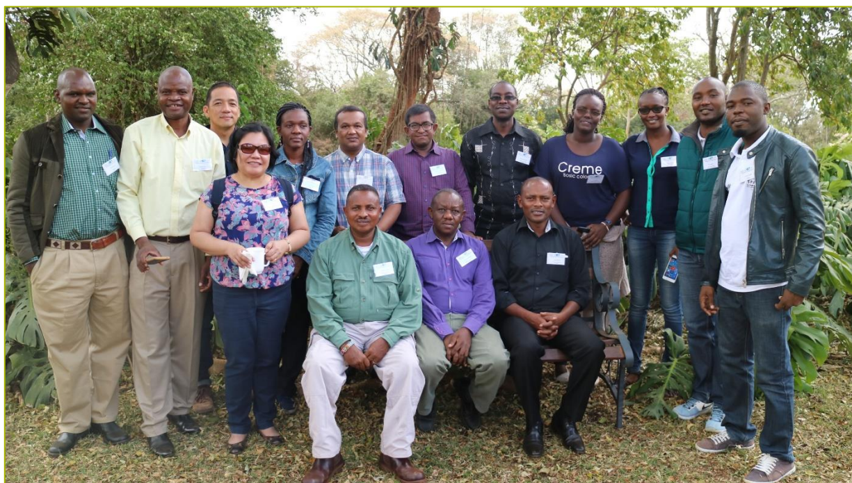
Expert GA facilitators from Bangladesh, Philippines, Kenya, Uganda and Zambia

On day three, site-level governance assessment facilitators came together at IUCN Headquarters to share experiences with understanding the good governance principles, to practice planning a GA process and to impart their top tips when undertaking a GA.