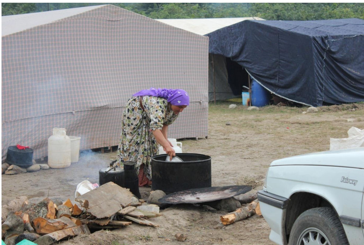
Photo 2. Hazelnut worker is cooking meal (Uzunisa camping site-Ordu)