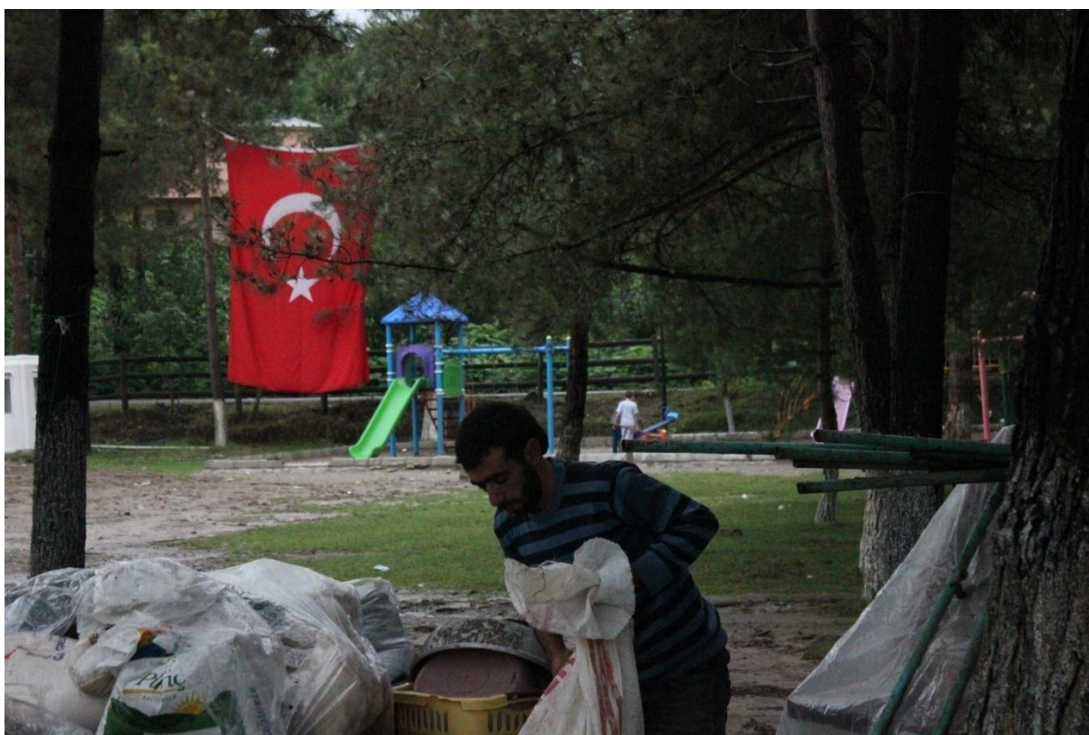
Photo 15. Turkish flag in the entry of Uzunisa camping site (Uzunisa camping site-Ordu)