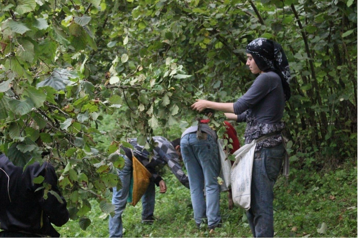
Photo 16. Workers are collecting hazelnuts (Village of Maden/ Bulancak/Giresun)