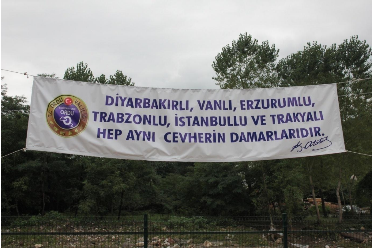
Photo7. Poster of Atatürk's dictum in Uzunisa camping site: "From Diyarbakir, from Van, from Erzurum, from Trabzon, from Istanbul, from Trakya they are all the sons of one nation, all the veins of one jewel"(Uzunisa camping site-Ordu).