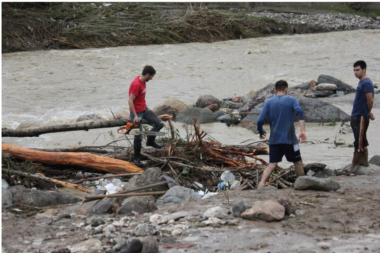
Photo 14. Villagers are collecting wood from riverside after the flood (Uzunisa camping site-Ordu)