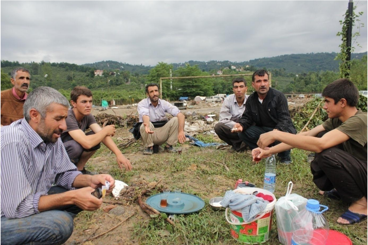
Photo 12. Conversation with the workers after the flood (Uzunisa camping site-Ordu)