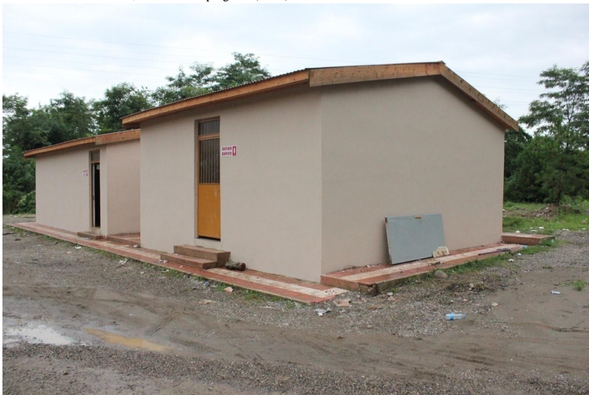
Photo 6. Baths and toilets in camping site (Uzunisa camping site-Ordu)