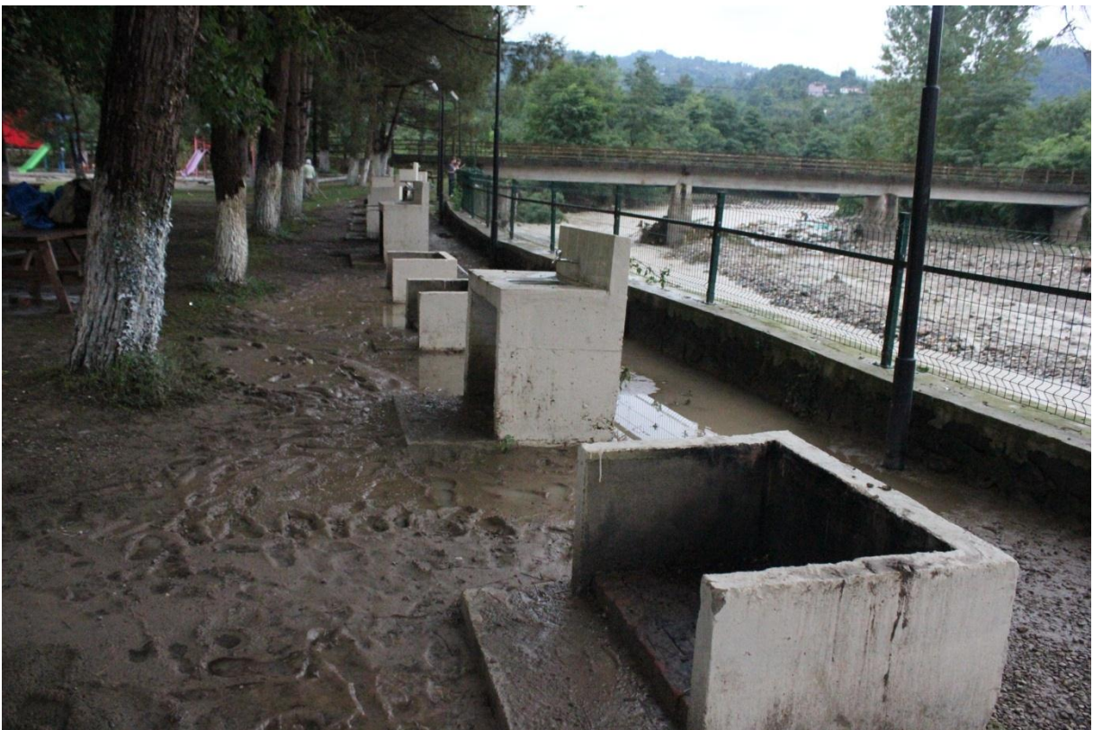
Photo 13. Cooking places in The Uzunisa camping site after the flood (Uzunisa camping site-Ordu)