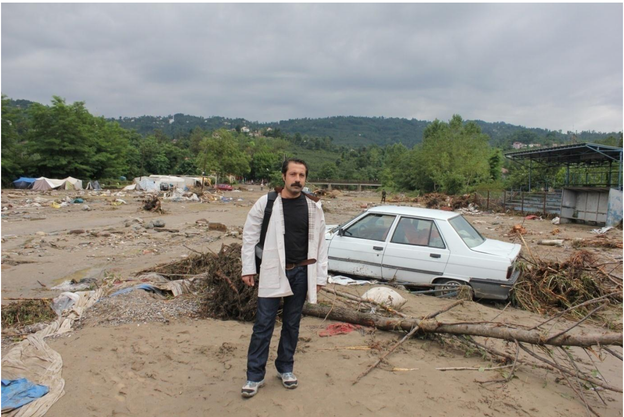
Photo 11. Researcher is in the Uzunisa camping site after the flood (Ordu)