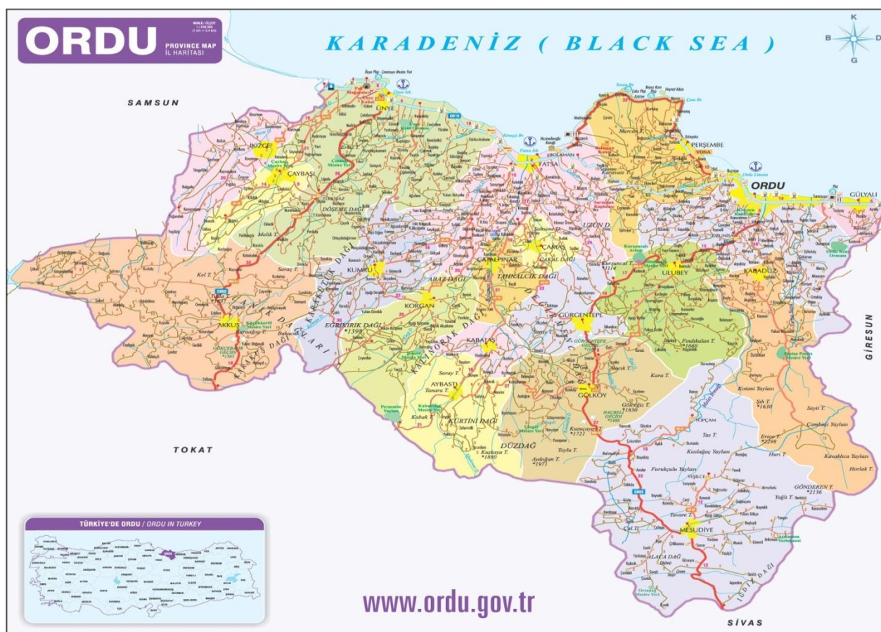
Map 1. Ordu map