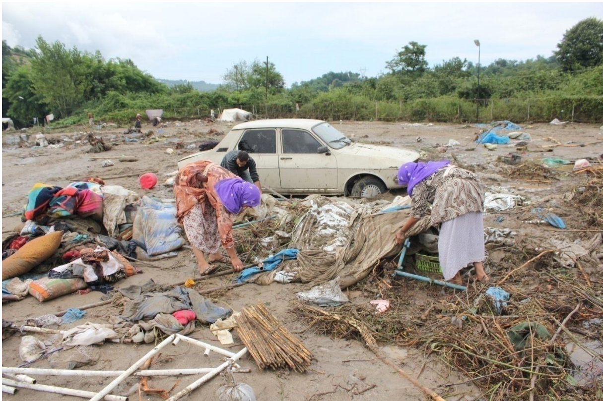
Photo 8. After the flood Uzunisa camping site(Uzunisa camping site-Ordu)