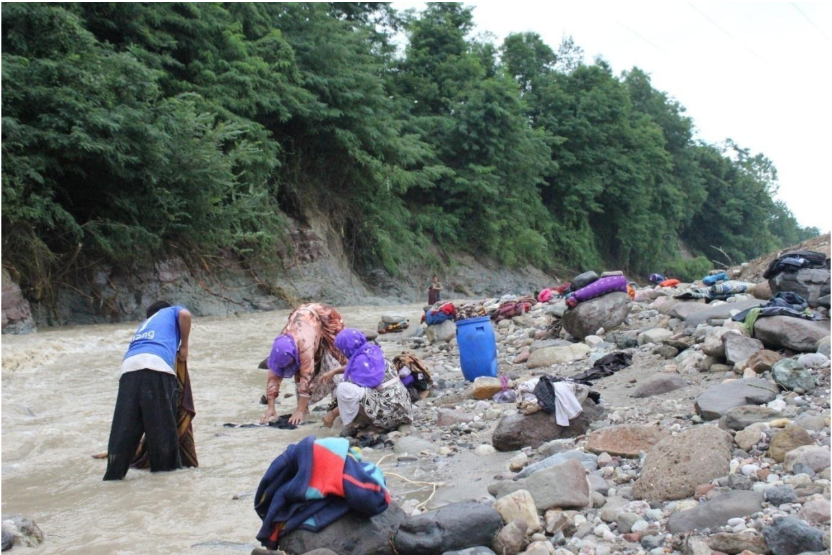
Photo 9. Workers are cleaning their daily stuffs in the river. (Uzunisa camping site-Ordu)