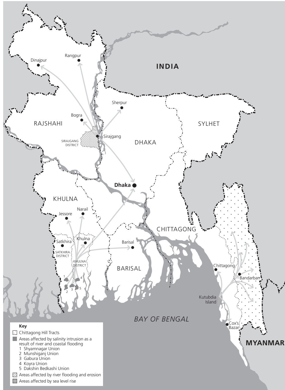
Illustration of migration flows from findings of field research

1 As the research has found that the destination areas for temporary and permanent migration are similar, patterns of temporary and permanent migration have not been differentiated in this map.