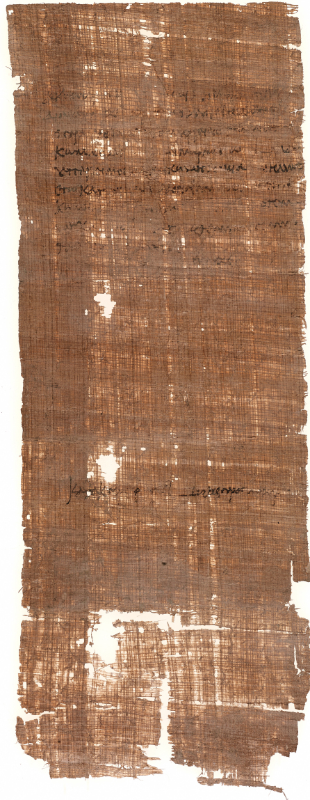
P.Mich. inv. 4406a.