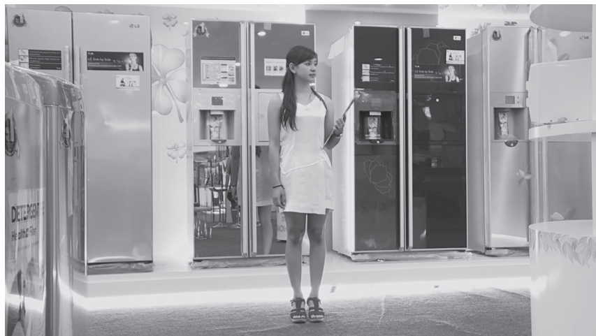
Figure 9. A sales clerk waits for customers in The Act of Killing .

not about terror and military repression alone. As we've seen in earlier chapters, the elimination of communists was also a moment of "primitive accumulation," which produced "a cheap and submissive labor force" attractive to foreign capital and left the country free to prioritize export-oriented economic growth. 53 Meanwhile, General Suharto explicitly supplanted Sukarno's Third Worldist, decolonizing ideology of "revolution" with one of technocratic, Western-oriented "development," or pembangunan . 54 The shopping mall functions as a metonym for the everyday world that resulted from the elimination of leftists, indexing Indonesia's rise in the ranks of newly industrializing Asian-Pacific economies. Heryanto summarizes the constitutive link between Suharto-era authoritarianism and economic expansion: