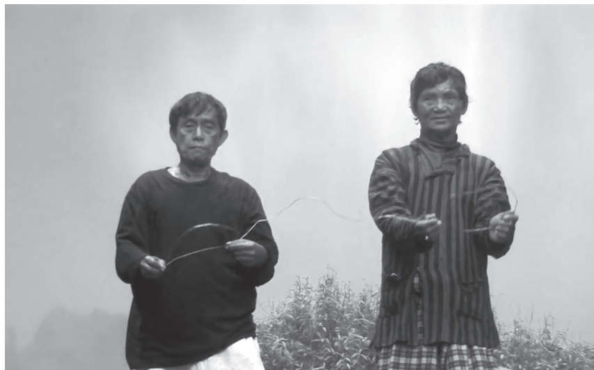
Figure 8. “Dead” communists remove the wires that killed them in the film-within-a-film of The Act of Killing .

authentic/fake, performance/re-enactment, reality/fantasy to be ultimately undecidable.” 4