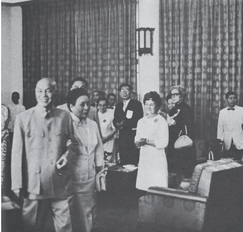
Figure 2. President Chiang Kai-shek and Madame Chiang (Soong Mei-ling) entering a reception hall at the 1970 Asian Writers' Conference held in Taipei.

U.S. President Richard Nixon's visits to Beijing, in 1971 and 1972 respectively, after which the United States changed its diplomatic affiliation from the Republic of China (ROC) to the People's Republic of China (PRC). The UN seat and powerful Security Council membership also switched from the Taipei-based Nationalist government to Beijing's Communist Party; 45 Chiang Kai-shek had died just the previous year. The isolation of Taiwan is further evidenced by the fact that the 1981 Manila meeting calls itself the Fourth PEN Asian Writers' Conference, apparently ignoring the 1976 Taiwan meeting altogether. 46 At the latter, the geopolitical standoff across the Taiwan Strait (which continues today) results in a more explicitly anti-communist sentiment than at earlier meetings, while the "principle of freedom" is ever more narrowly defined.