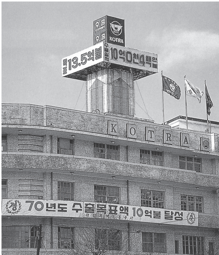
Figure 1. Seoul’s Export Tower, December 1970, listing US$1 billion as the achieved target export earnings.