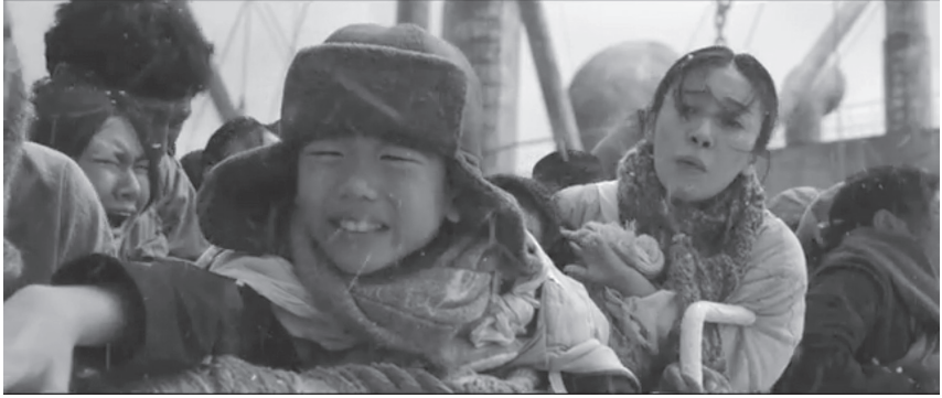
Figure 11. The young Dök-su realizes he has lost hold of his sister, Mak-sun, as they struggle to board a U.S. warship evacuating Hüngnam in Ode to My Father .

ship departs. The family unit is thus violently and tragically sundered, confirming the tight structural analogy between family and nation throughout the film. The film goes on to narrate Dök-su's life over the next decades as he struggles to provide for his mother and two remaining younger siblings in their new life as displaced people in Busan.