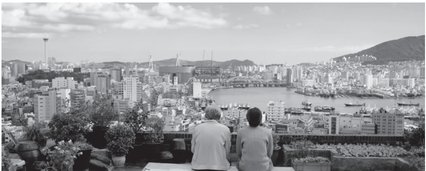
Figure 12. The elderly Dök-su and his wife sit overlooking a view of present-day Busan in Ode to My Father .

Tellingly, in Yoon’s film, the clearest marker of time between “then” and “now” is not dictatorship and post-dictatorship, or pre-1991 and post-1991, but simply the gap in material progress, most clearly marked by panoramic scenes of the present-day port of Busan (Figure 12). Politically and aesthetically, there is no demarcation between a world in which there are one or two (or three) competing social-political systems. At an obvious level this is because the peninsula remains divided but, at a deeper one, I suggest that it is because the Cold War was less experienced as an abstract ideology than through the material traumas and struggles of the developmental state itself. In a heartrending scene at the end of the film, the elderly Dök-su collapses in grief and tears at the still-fresh memory of losing his father in the Korean War. When his father appears to him in a kind of wish-image, he tearfully explains that he did his best to look after the rest of his family in his father’s absence—but “it was so,