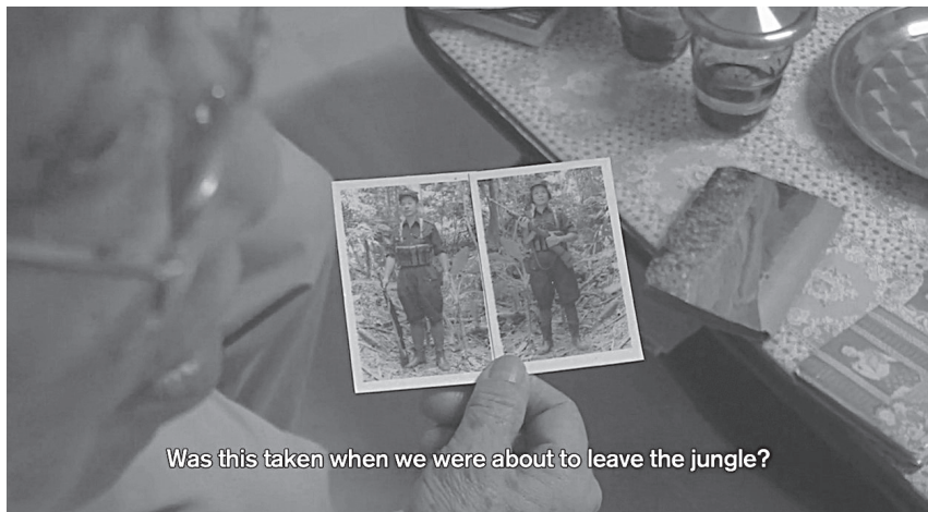
Figure 6. He Jin and Shu Shihua reminisce about their time in the jungle in To Singapore, with Love .