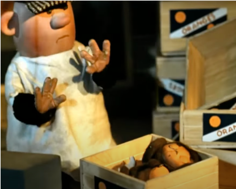
Figure 5. Still from Gena the Crocodile (1969). Cheburashka being discovered by a shopkeeper in a crate of oranges, unsure of his true origins.