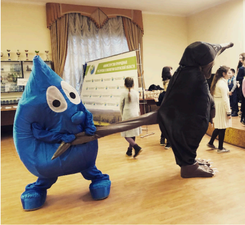
Figure 4. Kapa the water droplet antagonizes Khokhulya by pulling his tail at a community educational event.

and “putting an end to any rumors of rivalry among them once and for all.” 50