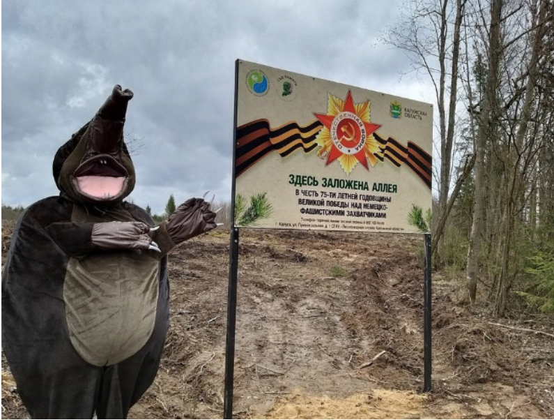
Figure 2. A promotional image of Khokhulya the Russian desman posing next to a Kaluga Oblast-officiated sign that reads, “Here stands a [pathway] ...in honor of the 75th anniversary of the great victory over the Nazi (lit. fascist German) invaders!”

Anthropocene is inherently, undeniably, environmental. It must be environmentally understood to be adequately defined by the “technological condition.” 29 Media archaeologists must conceptually weave together an understanding of geopolitics and ecological practices in their media work to understand resource depletion and, of course, its impact on the other lifeforms residing alongside humankind, especially animals and other organisms at risk for extinction or significant population decline. Therefore, the relationship between geology, Earth, and art remains significant—it is “fundamentally conditioned by the existence of inorganic life” and remains “expressive in an ontological sense” without human interference. 30