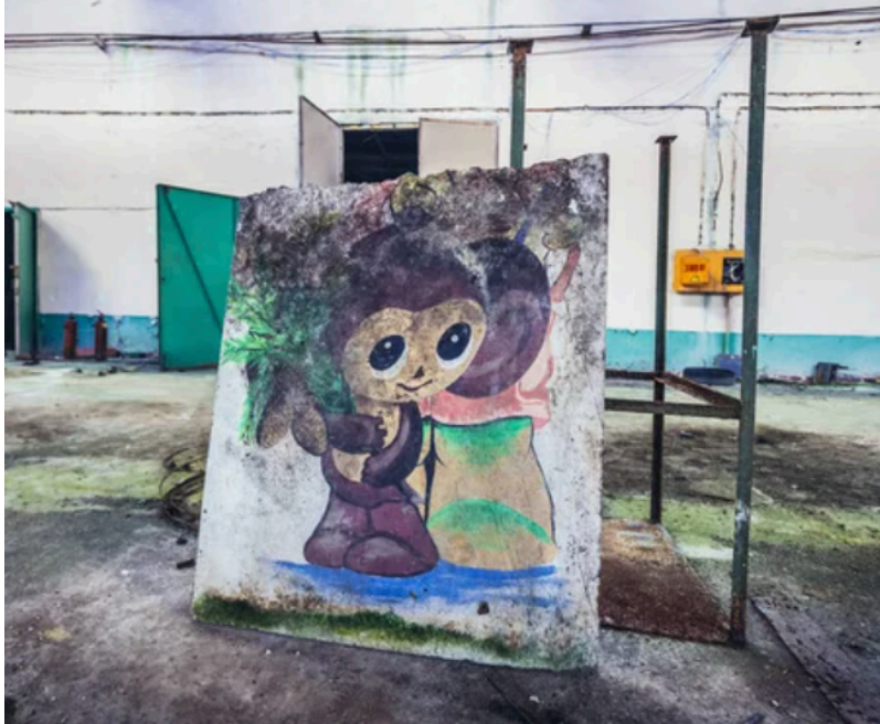
Figure 3. Photograph taken in Pripyat, Ukraine on September 18, 2016, depicting a faded poster with Cheburashka cartoon in the Jupiter Factory (завод Юпитер), Pripyat, an abandoned city in Chernobyl Exclusion Zone.