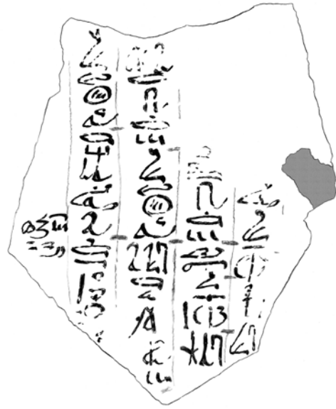
FIG. 2. Facsimile drawing.