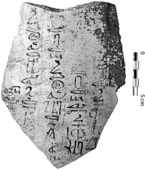
FIG. 1. Photograph of the Amheida ostrakon. 7