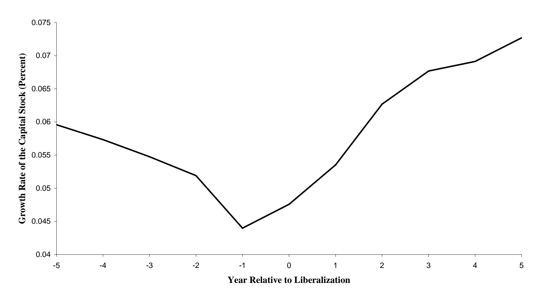
Figure 2. Investment Booms When Countries Liberalize the Capital Account .