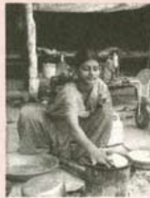
Mukul Dube Collections