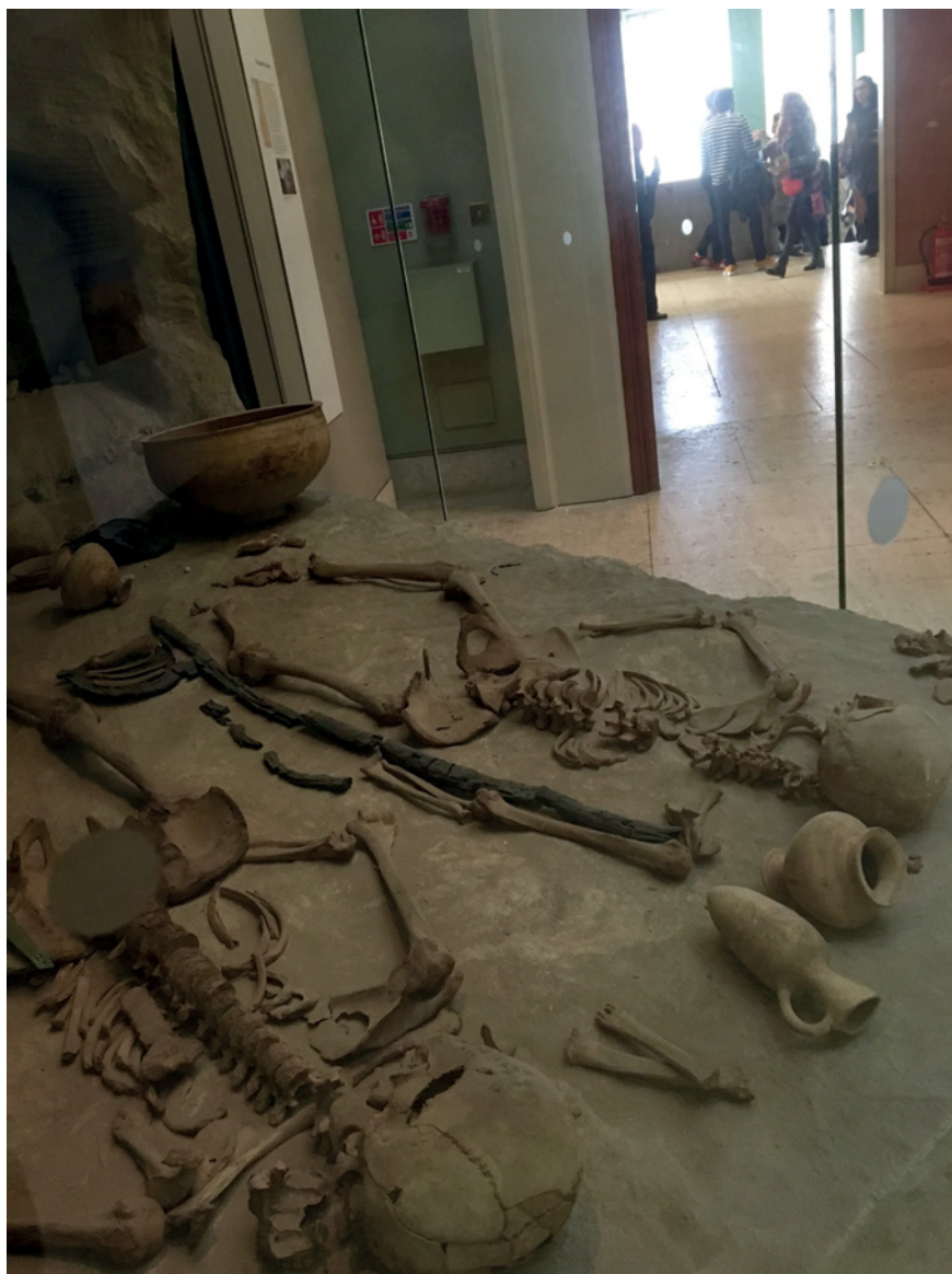
FIGURE 4 Middle Bronze Age tomb at Tell es-Sultan excavated by Kathleen Kenyon and reconstructed in the British Museum.

The objects Kenyon discovered are far from invisible. One of the tombs she excavated is currently on display in recreated form in the British Museum, where the Palestinian contribution is not mentioned (fig. 4). A photograph of the tell throws 'Ein as Sultan into dark shade, while the exposed archaeological