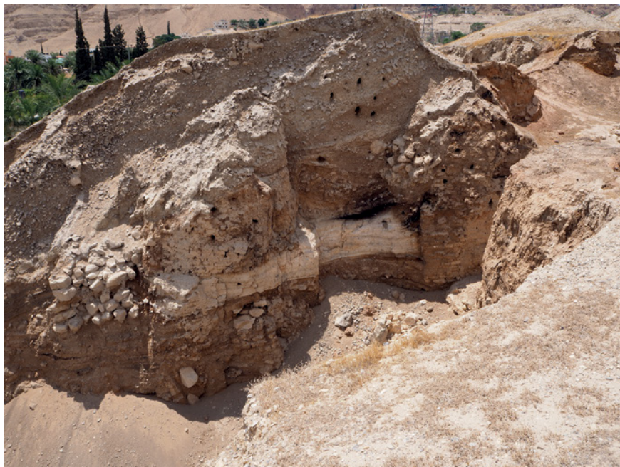
FIGURE 1 A section of the excavation at Tell es-Sultan.

The tell (a mound indicating past human settlement) outside Jericho had long been identified as the site of the ancient city, but attention intensified in the twentieth century. German excavations uncovered structures and walls between 1907 and 1910. 29 Stereoscopic views distributed by Underwood and Underwood circulated around the English-speaking Atlantic world soon afterwards, as part of a set depicting sites where biblical events were held to have taken place. The viewer was instructed to look “through” the three-dimensional illusion and feel them as “the very realities which they represent.” 30 Thereby,