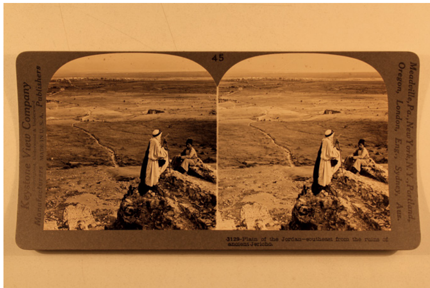
FIGURE 2 Underwood & Underwood / Keystone View Company, “The Plain of the River Jordan—Southeast from the Ruins of Ancient Jericho,” circa 1890s PHOTOGRAPHIC PRINT ON STEREO CARD, GELATIN SILVER, 9 CM × 18 CM. STEREOSCOPIC SLIDE FROM THE SERIES TRAVELING IN THE HOLY LAND THROUGH THE STEREOSCOPE BY JESSE HURLBUT.

The next slide in the set shows the ruins themselves, excavated by the German expedition, showing buildings and what is said to be the “city wall”