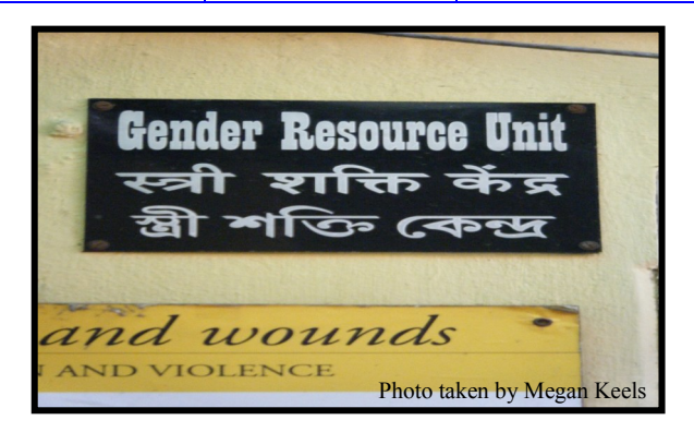
Sign posted in AAWW office in Kolkata