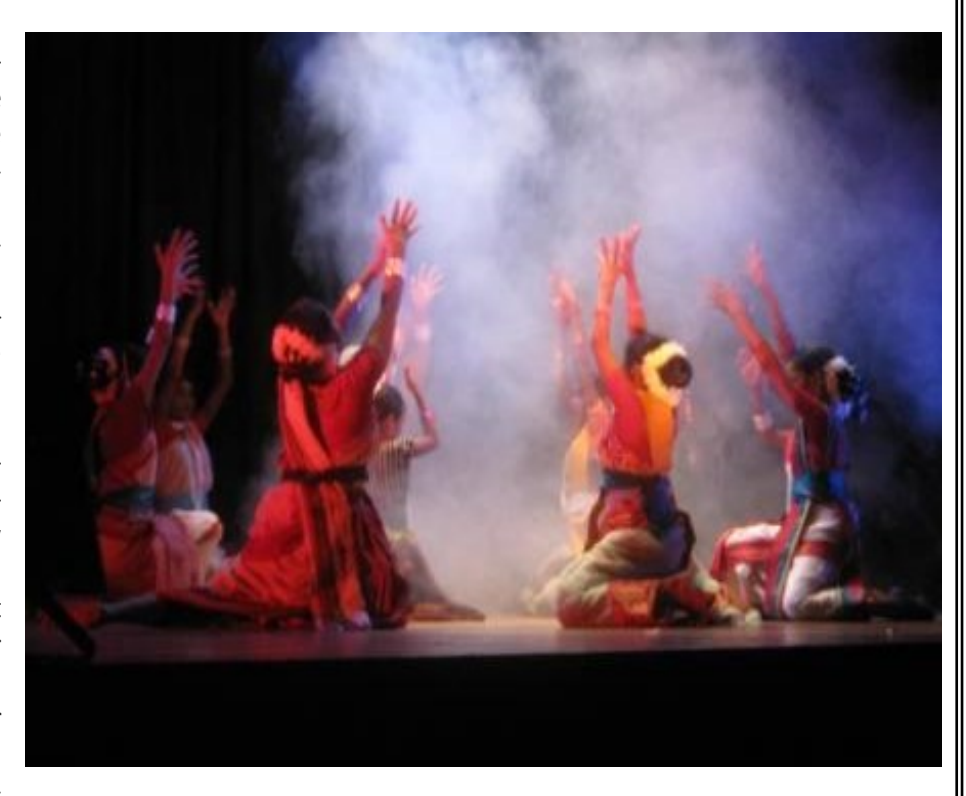
Apne Aap girls in a dance performance formation at ICCR in Kolkata

being and has been relentlessly human rights. [...] We must funda-