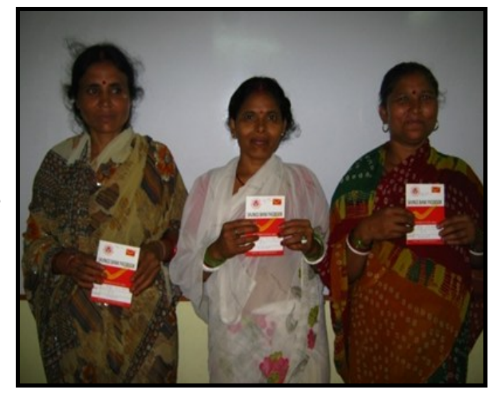
Photo of Mita Group Members opening their post office savings accounts

If the community women will get this card then it will be a very great achievement for them as the community women actively participate and interact with the government officials. Obtaining this BPL card will be very helpful to getting their rights to live with dignity as guaranteed by our constitution.