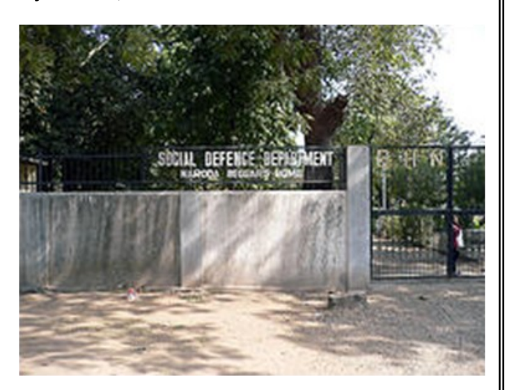
The previous Chhara settlement. It still has barbed fences and surrounded by high walls. It is used as a vagrant's home for rehabilitation now. From one settlement to another.

After five years of Independence, in 1952, they got released from the Settlement and the Criminal Tribes Act 1871 was replaced by Habitual Offenders' Act, which is still in use. I was thinking of our own Nat community in Bihar. The members of Nat community have still been forced to live in red light areas. Aren't these a new form of settlements for them? After so many years of Independence, the Nat and many communities in Bihar, Rajasthan and other states are still left to live as outcasts, so that the mainstream societies can exploit them whatever way they want to; to recruit the men as foot soldiers or