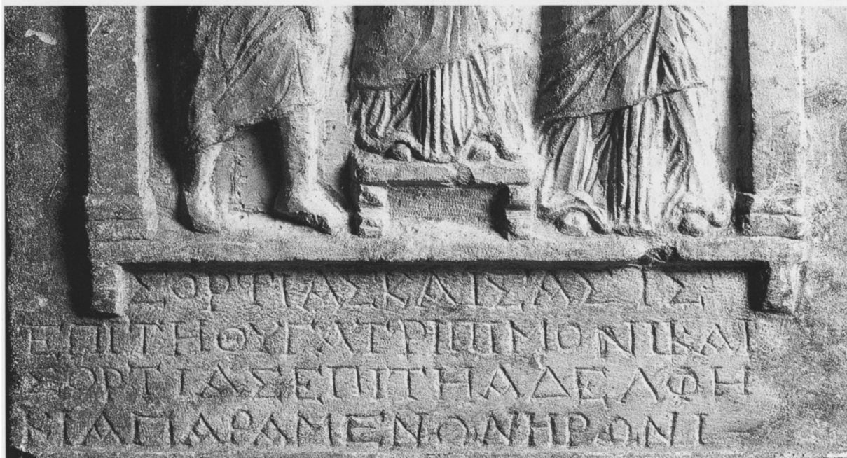
Epitaph of the Bierzo District Museum, Detail J.-M. Nieto Ibáñez, pp. 173–174