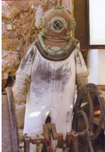
Figure 3. A suit used around 1900 by Simiot sponge divers (photographed by the author in 2008 at the Museum of Naval Art at Symi).

The war between Greece and the Ottoman Empire ended soon by the intervention of the Great Powers. By 1900, the Greek army was withdrawn from Crete and the heliograph operators left the islands. However, the operator of the Antikythera heliograph, escaping the military and financial bureaucracy of Greece, stayed at Potamos, the little port of Antikythera, enjoying the cheap and simple life of the island and his monthly salary!