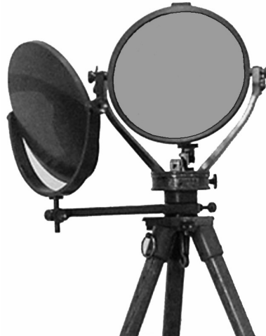
Figure 1. The optical telegraph.

from several European countries) came to Crete and fought for the liberation of the island). In February 1897 the Greek government sent military forces to the island, under the royal adjutant Timoleon Bassos, provoking a war with the Ottoman Empire. Immediately the Ottoman administration, with the consent of the Great Powers (Italy, France, Austria-Hungary, Germany, Great Britain and Russia), blockaded Crete and restricted all communications between the island and Greece. The Greek Ministry of War reacted by establishing an optical telegraph between Cape Grambousa in NW Crete, Antikythera and the Port of Kapsali at Kythera, which was Greek territory. From there communications were transmitted to Athens by wire.