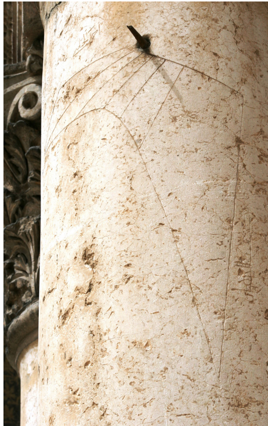
Figure 3. Sundial of Ahmad al-Halabi (†1455), chiselled into a column of the Dome of the Treasury in the Umayyad Mosque of Damascus.

A look at the unglazed verges on both sides of the meridian line confirms this solution: they look like they were pushed out, for the transverse edges show no relation to the corresponding