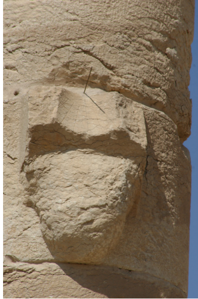
Figure 2. Sundial in Palmyra, at a column erected in 64 for Shalamallat, son of Yarhibola.

original setting, the different surface treatment of the pavement is telling: while the broader middle stripe with its bronze insertions shows a smooth surface, the two lateral stripes feature roughly-carved surfaces and open-lying clamps, a clear testimony that these lateral stripes were originally covered by at least one more layer of stone, about 1.50 metres in width. Thus in its original state the pavement was flanked by broad (and shadow casting) boarder walls ” (Italics mine). 32 Buchner shies away from the consequences that result therefrom. He therefore formulates this in the subjunctive: “stone blocks would have actually been on both sides of a cultured, elevated stripe, the shadow edges were cast out to the west of it in the morning and to the east side in the afternoon; only at the moment of day’s highest solar altitude, at midday, would a shadow have been cast out on neither side.” 33