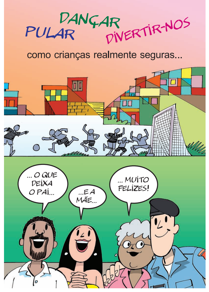
Figure 2: "Now we can play, dance, jump, enjoy ourselves, like children who are really safe, which make father, and mother very happy."