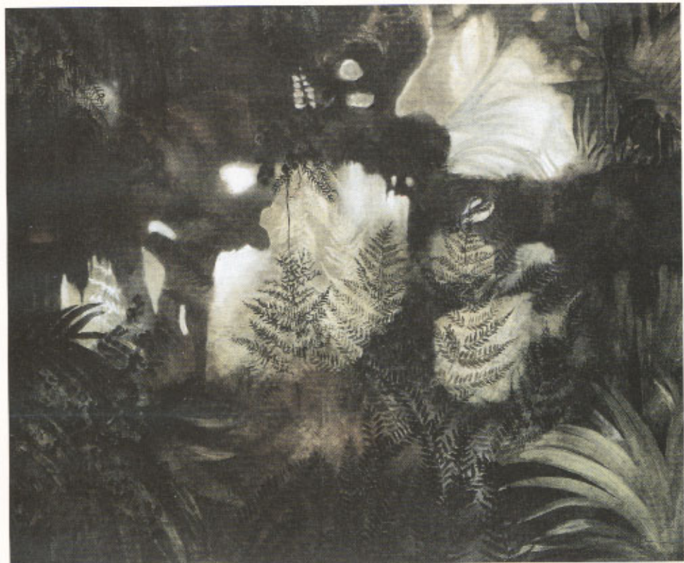
Heleen Cornet, "The Fantastic City of the Rain Forest", Acrylic