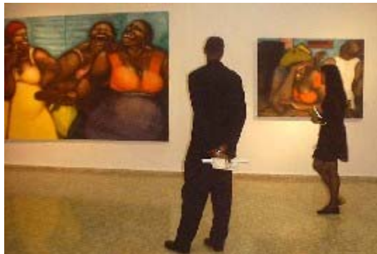
Painting by Christine Matuschek

In speaking with the owners of two local art galleries, I was informed that more than 90% of their sales are to tourists. This is a double-edged sword. While good economically, it also means that most of Grenada's art is being carried away from Grenada - never to be seen by the next generation. This leads to yet another investment that must be made; a permanent space for the visual arts to be displayed in Grenada. This should take the form of a National Museum for Visual arts, including additional space for an educational component. The Grenada Art Council for the past five years has been collecting important pieces of Grenada's art with the concern that it be preserved for Grenadians. Unfortunately, the collection is in storage, because of lack of an adequate facility.