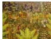
Painting by Elinus Cato

When considering an investment into a sustainable resource, the question will arise - what will be the benefit? Is this investment one that will continue to give yields far into the future?