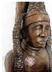
Carving by Wayne Snagg

In other words, we have much more to express than just the typical scene that a tourist may purchase for a souvenir.