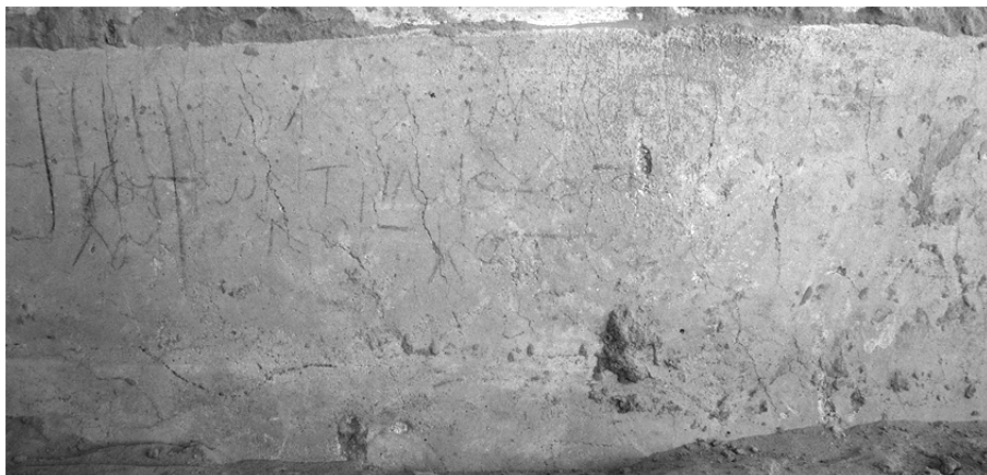
zu R. Ast, R. S. Bagnall, S. 4, Fig. 4: The dipinto