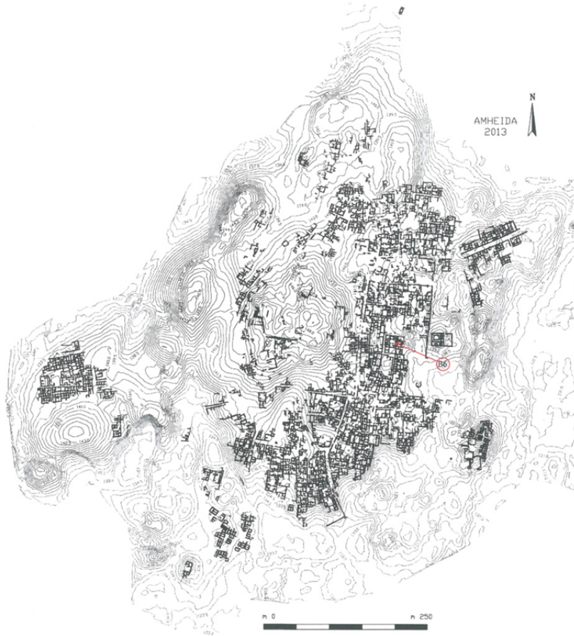
zu R. Ast, R. S. Bagnall, S. 1, Fig. 1: Map of the city of Trimithis