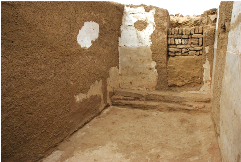
Fig. 2: Plan of Building 6. Dipinto found on the west wall of Room 25