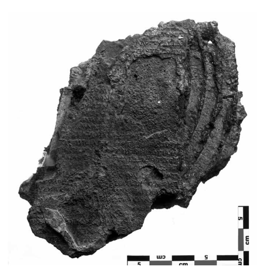
Figure S2. Fragment B-1. Offset remains of the Back Cover Inscription cover the left twothirds, with a small fragment of the Back Cover plate adhering at the extreme lower left. Parts of the Metonic Dial scale inscriptions are exposed to the right