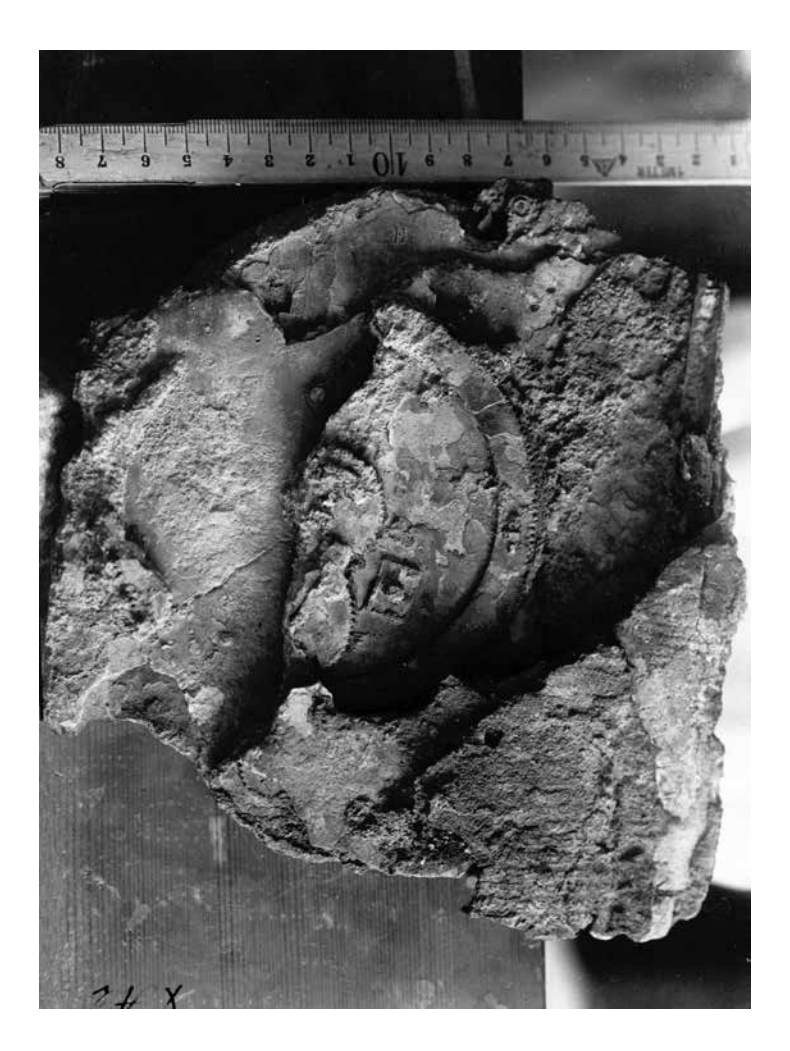
Figure S7. Fragment A-2 in 1918 (?), after the c. 1905 conservation, which involved the separation of Fragments 19 and 67. The Back Plate Inscription and a part of the Saros Dial scale were exposed in the extreme right, as at present. The offset remains of the Back Cover Inscription were more extensive than at present. The Exeligmos Dial was still concealed under patina