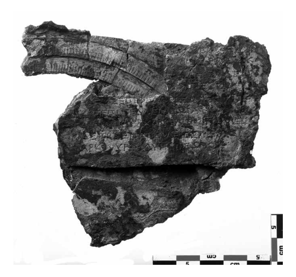
Figure S3. Fragment C-1. Parts of the Zodiac Scale (inner ring) and Egyptian Calendar Scale (outer ring) are exposed at the top and lower right. Covering them are parts of Parapegma Plate 1 (PP1, top) with a portion of the Parapegma Inscription exposed and of Parapegma Plate 2 (PP2, bottom)