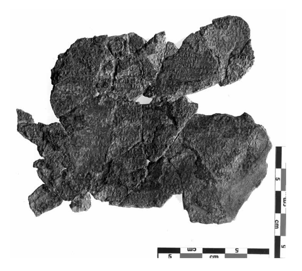
Figure S5. Fragment G, bearing part of the Front Cover Inscription