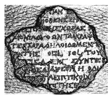
Figure 2.2: Fragment 19, a piece of the Back Cover Inscription plate, at actual size, image from PTM ak1a with specular enhancement

The inscriptions, when viewed directly, give an impression of neatness and regularity, which is largely due to their tiny size (Fig. 2.2). Under magnification, the sizes, line and letter spacing, and shapes of the letters prove to be rather irregular, though the engraver has clearly worked hard to imitate the appearance of serifed lettering on stone (Fig. 2.3). Correct syllabic word division has been respected at line-ends. There is no punctuation, and numerals as a rule are not marked as such by an overstroke (an exception in the Back Cover Inscription, II.3) but are usually preceded and followed by modest vacats . Vacats also occasionally separate words, following no obvious principle.