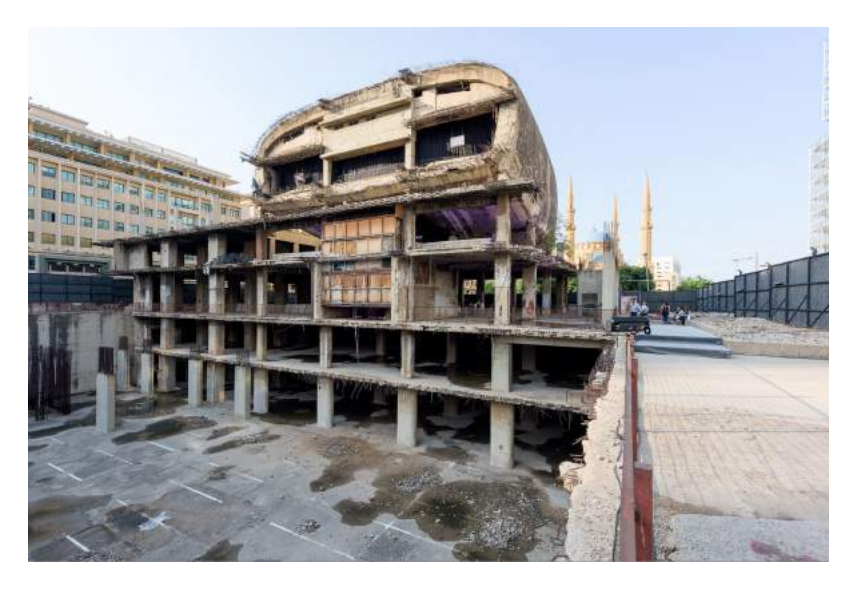
Figure 4. Emmeca 2023 "The Egg"

while others are of its facade, a covered, seamless egg shape. Most images are of the outside of the egg, but a few of its interiors, its concrete rows of seats facing an empty wall where a screen would have stood.