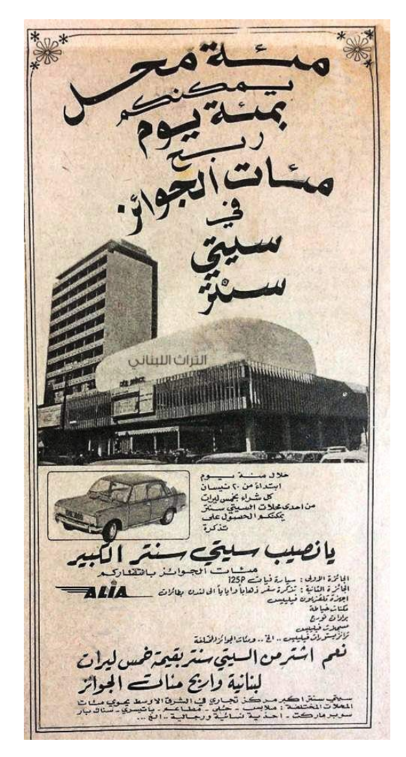
Figure 5. The original captions read: "A hundred stores. In a hundred days, you can win hundreds of prizes at the City Center."

shows the BCC from a similar perspective. This old image,<sup>59</sup> however, takes place in front of the complex, likely because that is its facade, and because its open back would not have been visible at the time. The reversal of the position of the camera while maintaining its low angle suggests a continuity to the Egg from an onlooker's perspective, a continuity which links the past with the present, lost dreams of wealth and modernity with ruin and despair. Such proposed continuities paint a picture of what history has been canonized, leaving around its edges openings through which to peek and imagine other histories.