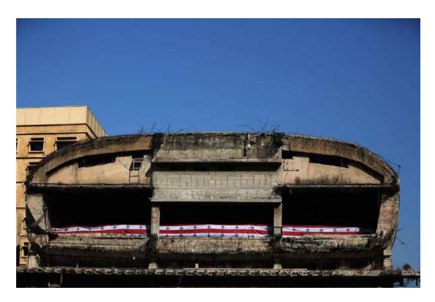
Figure 6. Mackenzie 2019.

A banner of the Lebanese flag stretches across the floor. This photograph was taken on November 5, 2019, <sup>60</sup> just two weeks after October 17, 2019, revolution broke out. <sup>61</sup> The "Eggupation" which forms the background for this image—why the flag was put up inside the Egg—became a physical manifestation of the revolution, as protesters filled its hollows in a trespassing act of reclaiming inaccessible, private spaces across the city.