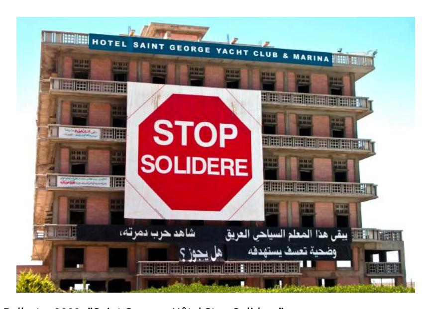
Figure 1. Ballester 2009. "Saint Georges Hôtel Stop Solidere"

It is impossible to walk around Beirut's downtown streets without noticing Solidere's impact, even before knowing of Solidere. Perhaps one of the first times an outsider may learn of Solidere would be encountering the now-abandoned St. George Yacht Club and Marina, which has been sporting a large "STOP SOLIDERE" sign since at least 2009. <sup>16</sup>