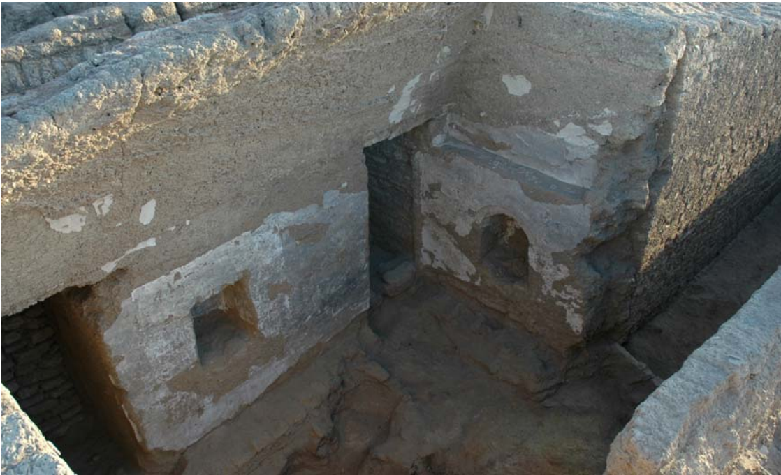
Plate 4: room B6 and corridor B7, partial view to the NE.