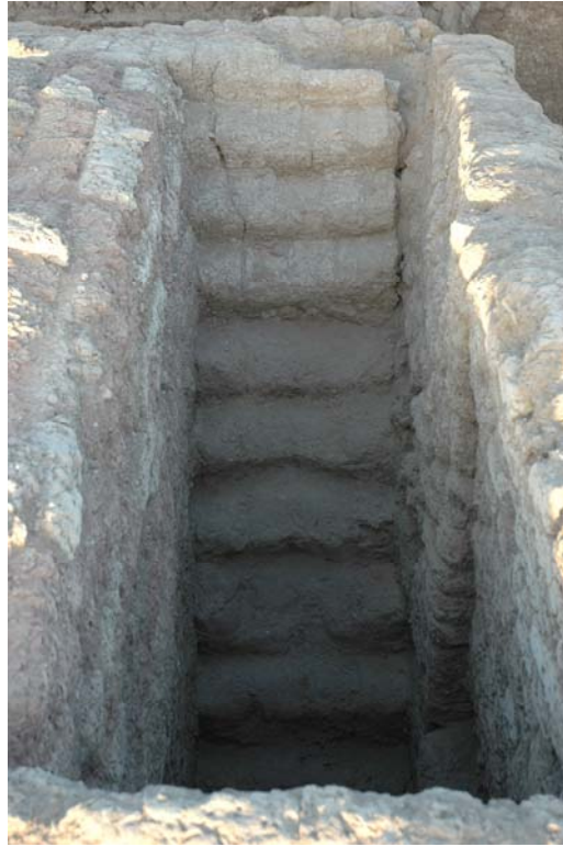
Plate 5: staircase B8, view to the W.