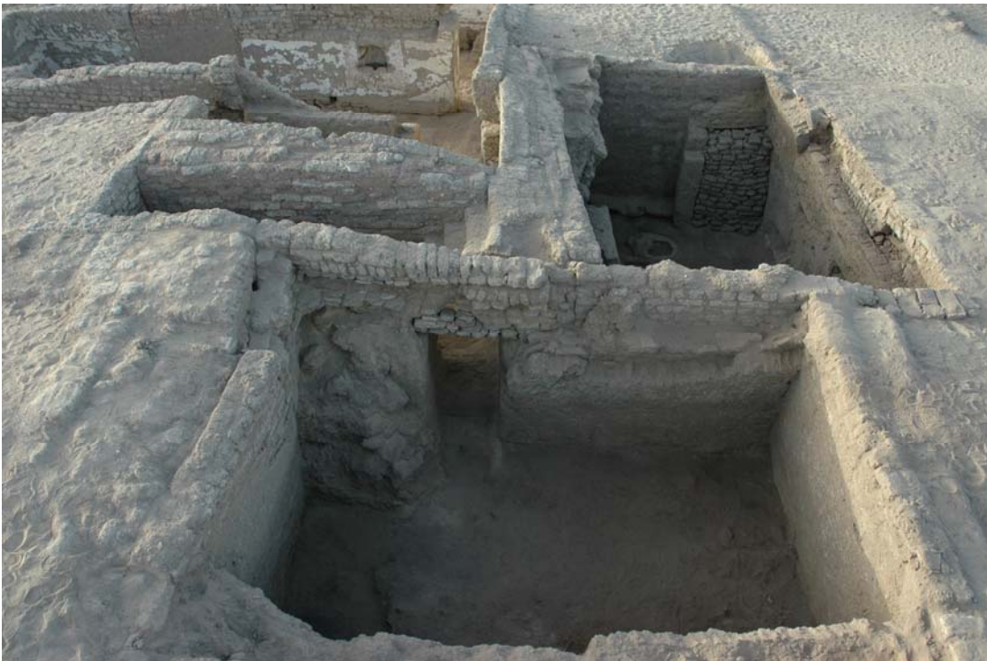
Plate 6: rooms B9 (in the foreground) and B10 (in the background to the right), view to the S.