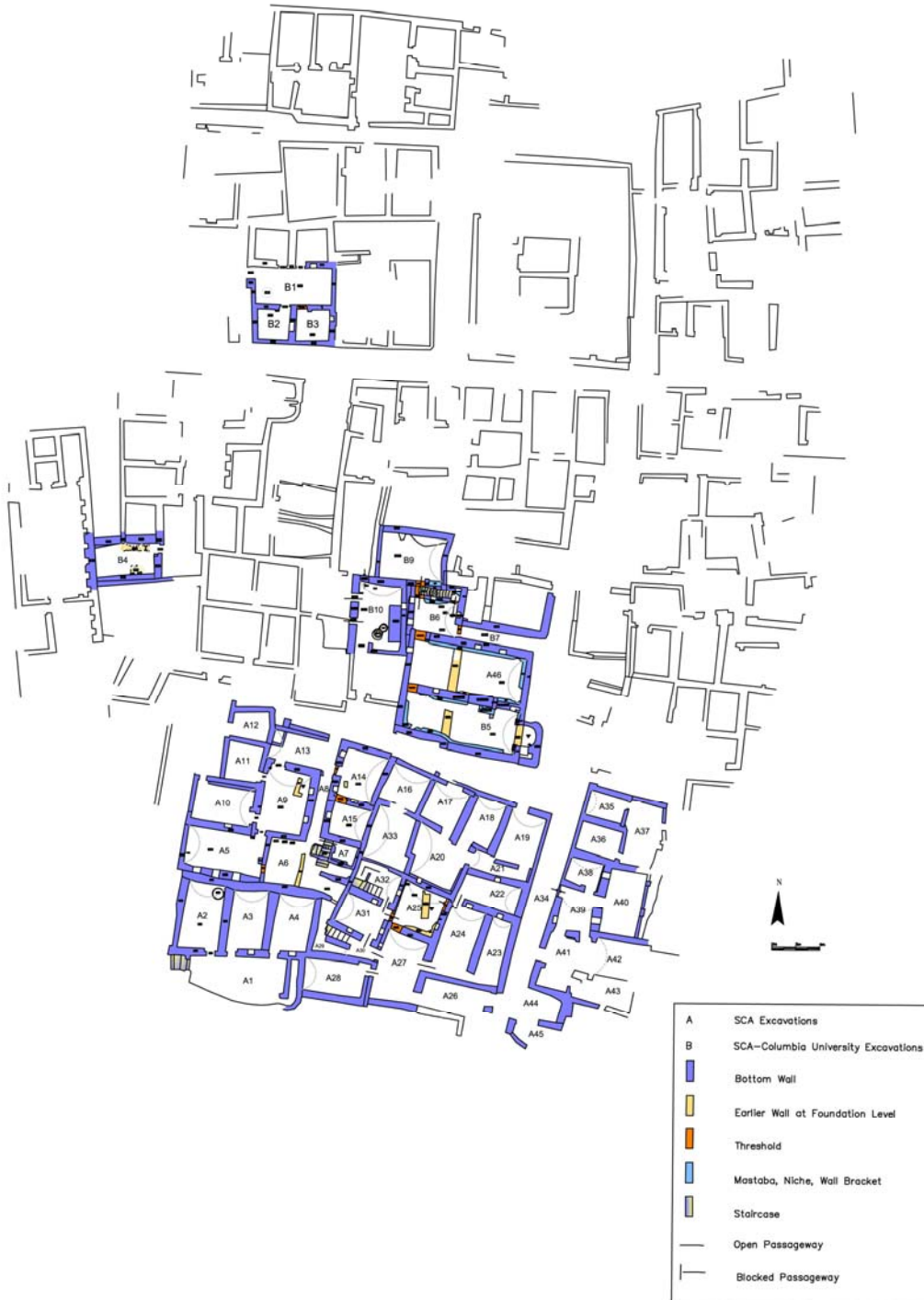
Plate 1: Mound I (Areas A-B).