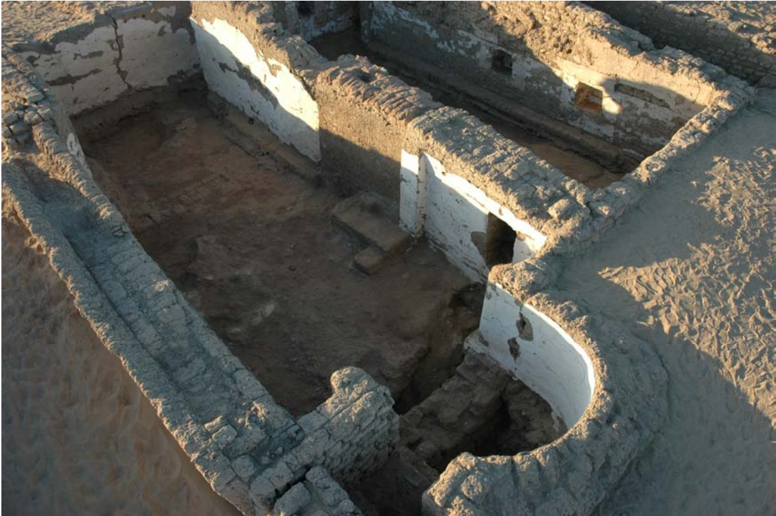
Plate 3: rooms B5 and A46, view to the NW.